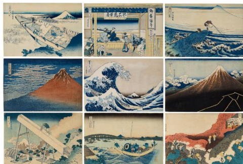
Property from a Prominent West Coast Collection KATSUSHIKA HOKUSAI (1760-1849) Fugaku sanjurokkei (Thirty-six views of Mount Fuji)