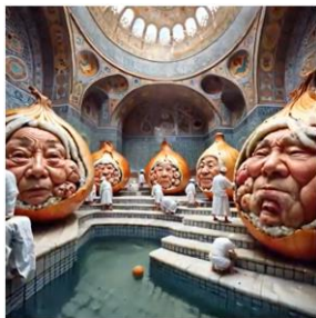
Niceaunties Onsen Ideals Of Nirvana (ONION) Estimate: 1-3 ETH