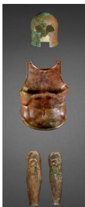
A GREEK BRONZE WARRIOR'S PANOPLY ARCHAIC PERIOD TO CLASSICAL PERIOD, CIRCA 7 TH -4 TH CENTURY B.C. Price realized: $504,000