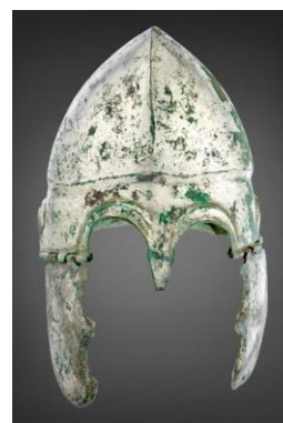
A GREEK TINNED BRONZE CHALCIDIAN HELMET LATE CLASSICAL TO HELLENISTIC PERIOD, CIRCA 350-200 B.C. Price realized: $315,000

PRESS CONTACT: Edward Lewine | elewine@christies.com | 212 636 2680 Images for press use available HERE .