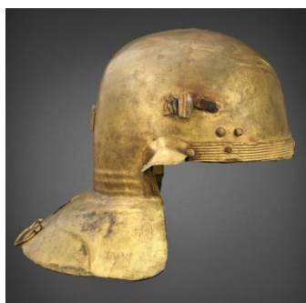
A ROMAN SHEET BRASS HELMET OF WEISENAU TYPE FLAVIAN TO TRAJANIC PERIOD, CIRCA 69- 117 A.D. Price realized: $315,000