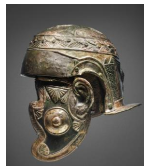
A ROMAN IRON AND TINNED BRONZE CAVALRY HELMET ANTONINE PERIOD, CIRCA 125-175 A.D. Price realized: $693,000