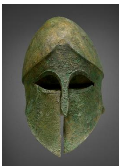
A GREEK BRONZE CORINTHIAN HELMET LATE ARCHAIC TO EARLY CLASSICAL PERIOD, CIRCA 525-475 B.C. Price realized: $478,800