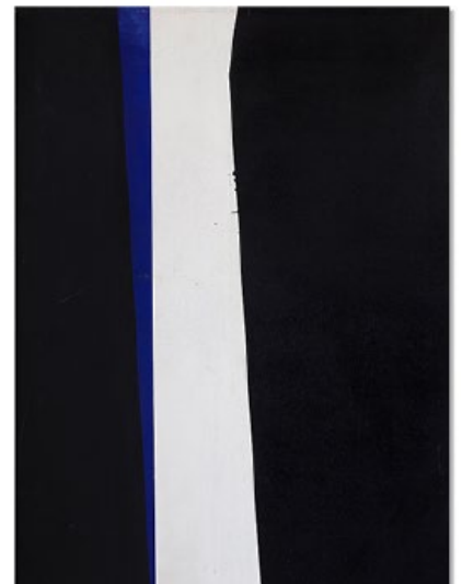
Mohamed Melehi, Untitled , 1962 © Christie's Images Ltd 2024 © Adagp, Paris, 2024