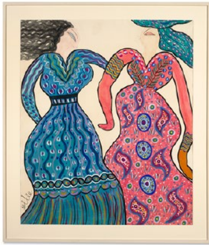
Baya, Deux femmes , 1968 © Christie's Images Ltd 2024