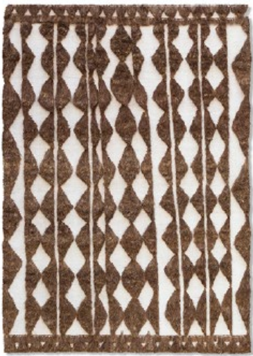
Amina Agueznay, Portal 5, variation 2/2 , 2022 Work by Amina Agueznay produced by the tiskmad cooperative

Other highlights from the show's include powerful self-portraits by Rafik El Kamel and a very beautiful creation by Amina Agueznay, at the boundary of different universes such as design, fashion, and artisanal weaving techniques. A large-scale photograph by Zineb Sedira, entitled Sugar Routes II , serving as a metaphor for the history of human migration across the oceans.