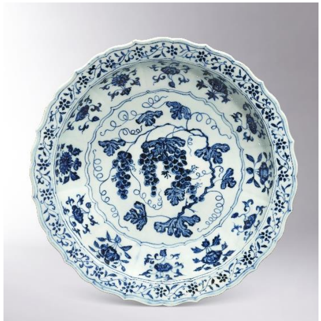
A MAGNIFICENT AND EXCEPTIONAL BLUE AND WHITE 'GRAPES' BARBED-RIM CHARGER YONGLE PERIOD (1403-1425) 17 ½ in. (44.5 cm.) diam. Estimate: HK$8,000,000 – 10,000,000