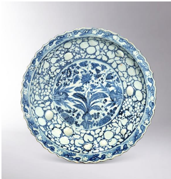
AN IMPORTANT AND EXCEEDINGLY RARE BLUE AND WHITE 'PLANTAIN TREE' BARBED-RIM CHARGER YUAN DYNASTY (1279-1368) 16 3/4 in. (42.5 cm.) diam. Estimate: HK$20,000,000 – 30,000,000

Magnificent in size, exceeding 42cm in diameter, this extremely rare 'plantain tree' barbed-rim charger showcases a combination of several decorative techniques. It features 'blue-on-white' motifs in the center, reverse 'white-on-blue' motifs on the well, and additional molded decorations. Chargers with such intricate designs would have required significant cost and time to produce, resulting in only small quantities being made for the upper echelon of society. The inclusion of the barbed-rim shape further adds complexity to the design, enhancing its appeal to collectors.