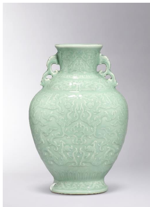
AN EXCEPTIONALLY WELL CARVED CELADON- GLAZED 'KU/ DRAGONS' VASE

QIANLONG SIX-CHARACTER SEAL MARKS IN IRON RED AND OF THE PERIOD (1736-1795) 11 3/8 in. (29 cm.) high Estimate: HK$16,000,000 – 22,000,000