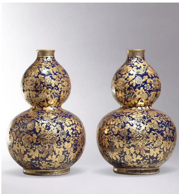
AN EXCEPTIONALLY RARE AND EXQUISITE PAIR OF BLUE-GROUND GILT-DECORATED 'MELON AND VINE' DOUBLE GOURD-FORM VASES

QIANLONG SIX-CHARACTER SEAL MARKS IN IRON RED AND OF THE PERIOD (1736-1795) 11 3/8 in. (29 cm.) high Estimate: HK$16,000,000 – 22,000,000