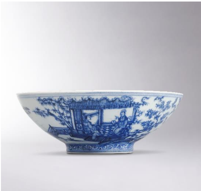
AN EXCEEDINGLY RARE AND OUTSTANDING BLUE AND WHITE 'LADIES IN GARDEN' BOWL XUANDE SIX-CHARACTER MARK IN UNDERGLAZE BLUE WITHIN A DOUBLE CIRCLE AND OF THE PERIOD (1426-1435) 7 ¾ in. (19.7 cm.) diam. Estimate: HK$15,000,000 – 18,000,000

China's rich ceramic-making history reached a new height during the Ming dynasty when exclusive imperial kilns were established to serve the Emperor and his family. The imperial kilns in Jingdezhen, particularly during the Yongle (r. 1403-1425) and Xuande (r. 1426-1435) reigns, upheld rigorous standards, discarding any piece with even minor flaws. This meticulous process ensured that only the finest works graced the palace, resulting in the scarcity of surviving imperial porcelain from these periods. The two highlights below epitomise the most coveted and exquisite imperial blue and white porcelain from the esteemed Yongle and Xuande eras, cherished by connoisseurs for centuries since the late Ming dynasty.