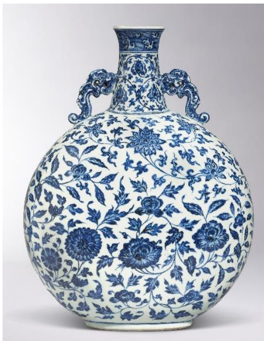
A MAGNIFICENT BLUE AND WHITE 'FLOWERS OF THE FOUR SEASONS' MOONFLASK YONGZHENG SIX-CHARACTER SEAL MARK IN UNDERGLAZE BLUE AND OF THE PERIOD (1723-1735) 16 ¼ in. (41.5 cm.) high Estimate: HK$18,000,000 – 26,000,000

Imperial porcelain from the Kangxi, Yongzheng, and Qianlong reigns in the 18th century showcases the pinnacle of technical excellence in Chinese ceramic production. During this period, a wealth of new glazes, enamels, and decorative techniques emerged. The three highlights below exemplify the diverse range of decorative styles found on Yongzheng and Qianlong imperial porcelains, including monochrome glazes, gilt enamels on colored grounds, and exquisite blue and white designs.