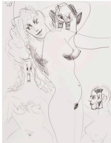
GEORGE CONDO (B. 1957) Untitled graphite on paper Drawn in 2007. Estimate: $50,000-70,000