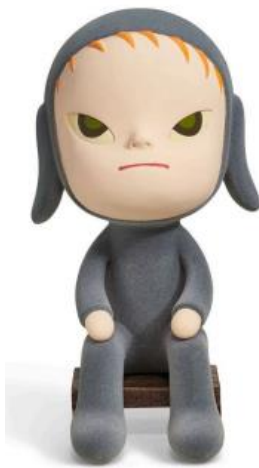
YOSHITOMO NARA (B. 1959) Sleepless Night Sitting flocked and painted plaster and wood, in original wooden box Executed in 2007. This work is number 154 from an edition of 300 and is accompanied by a certificate of authenticity signed by the artist. Estimate: $30,000-50,000