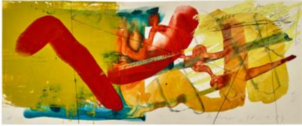
Property from the Orange Blossom Collection GERHARD RICHTER (b. 1932) Untitled gouache, watercolor and graphite on paper Executed in 1984. Estimate: $70,000-100,000