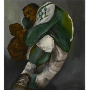
ERNIE BARNES (1938-2009) Matt Snell, New York Jets oil on canvas Painted in 1966. Estimate: $50,000-70,000