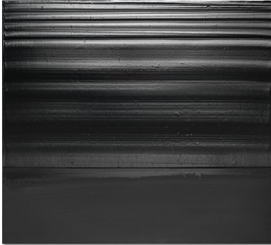
Pierre Soulages, Peinture 117 x 130 cm, 20 mai 2007, 2007 . Estimate: €500,000 – 700,000

The live sale will shine a light on two unique paintings by Pierre Soulages , produced five decades apart: Peinture 54 x 81 cm, 1951 (estimate: €600,000 – 800,000 ) and Peinture 117 x 130 cm, 20 mai 2007 (estimate: €500,000 – 700,000 ). The artworks – both from private collections – will go under the hammer for the first time.