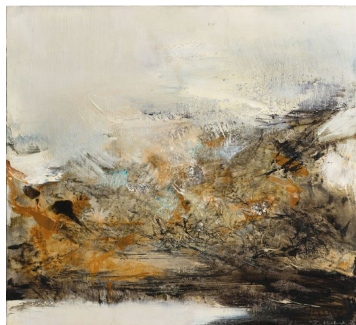
Zao Wou-Ki, 18.10.68 , 1968 Estimate: €350,000 – 550,000

Paris - Christie's presents two contemporary art sales – a live sale on 6 December and an online sale from 28 November to 8 December . The two sales have a global estimate of €8,500,000 – 12,300,000 . They will feature a carefully curated selection of sixty artworks for the live sale and one hundred and fifty lots for the online sale, including a large set of pieces from a prestigious French private collection.