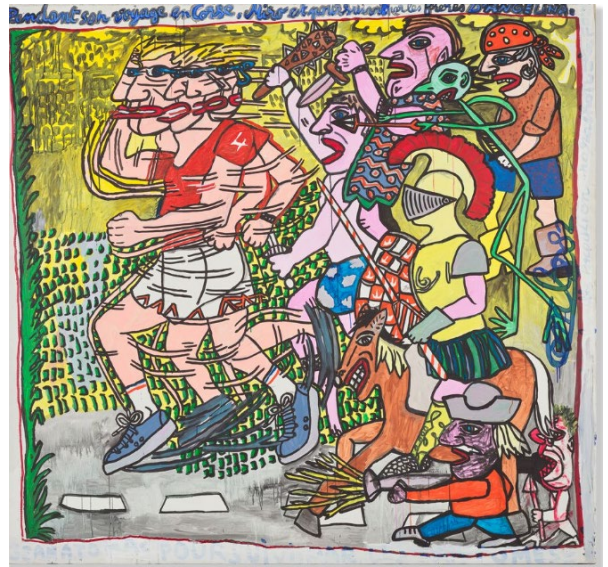
Robert Combas, Pendant son voyage en Corse , 1982. Estimate: €80,000 - 120,000