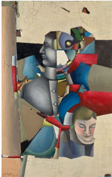
Richard Lindner, The Brothers (Homage to Nuremberg) , 1958