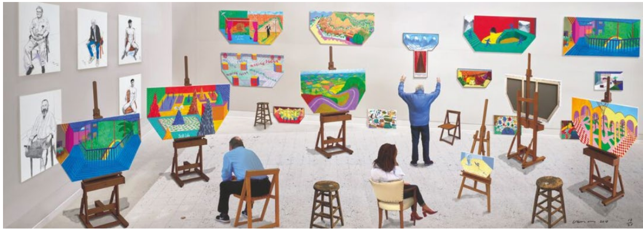
David Hockney, Inside it Opens Up As Well , 2018.