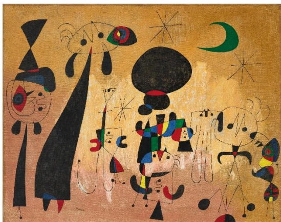
Joan Miró, Painting (Women, Moon, Stars) , 1949

French auction record in 2023 and French record for the artist