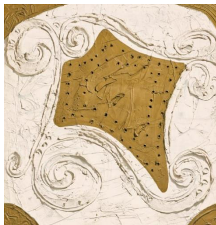
Lucio Fontana, [Concetto spaziale] , 1961