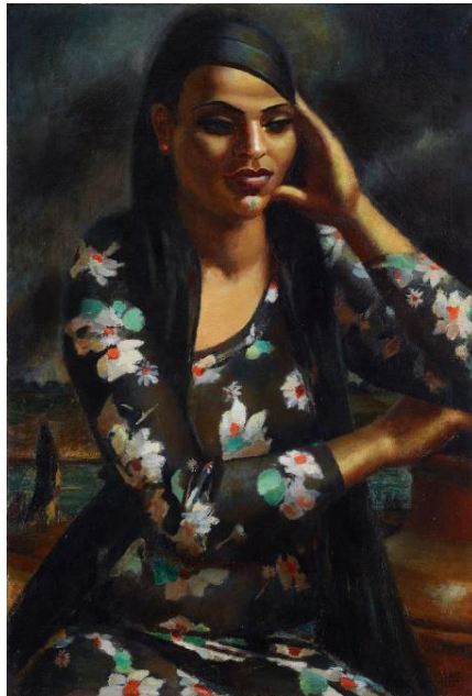
MAHMOUD SAÏD (1897, Alexandria - 1964, Alexandria) Fille à l'imprimé ( Girl in a printed dress ) Estimate £350,000-550,000