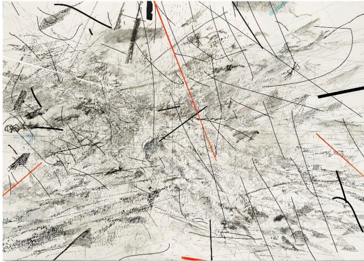
Julie Mehretu, Blue Magic , 2007, Sold for: €3,972,500

The 20/21 Century sale week started with LOVE STORIES - from the Collection of Anne & Wolfgang Titze , a major European private collection