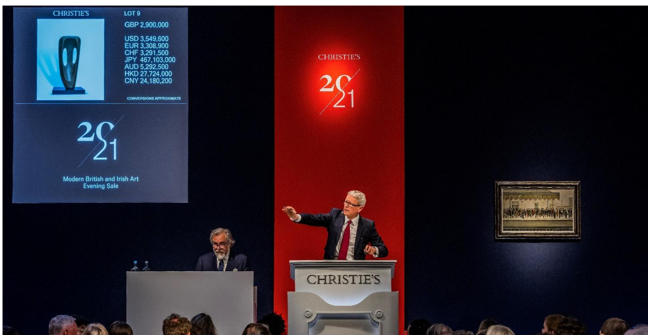
Barbara Hepworth, Pierced Form (Toledo) (Price realised: £3,522,000)

THE MODERN BRITISH AND IRISH ART EVENING SALE ACHIEVES A TOTAL OF £19,277,100 / $23,595,170 / €21,995,171