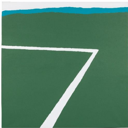
Raoul De Keyser's Kalklijn (1970, estimate: €50,000-70,000)

CHRISTIE'S POST-WAR AND CONTEMPORARY ART AMSTERDAM, 25 AND 26 NOVEMBER 2019