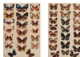
Drawings and Watercolours Lot 94

An Italian polychrome-painted wood sculpture of Saint Sebastian early 16th century, Emilia or Le Marche Estimate: £8,000–12,000