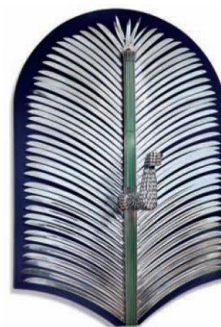
Arms and Armour Lot 50

A pair of Egyptian bronze eyes and brows, Third Intermediate Period - Late Period, 21st-30th Dynasty, circa 1070-332 B.C. Estimate: £5,000–8,000