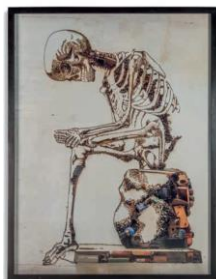
Post War and Contemporary Art Lot 10

Vik Muniz (Brazilian, B. 1961) Anatomy, after Francesco Bertinat (Pictures of Junk) digital chromogenic print 89 x 71 in. (226.1 x 180.3 cm.) Estimate: £10,000–15,000 Muniz incorporates the use of objects such as diamonds, sugar, thread, chocolate syrup and in the present lot's case 'waste' in his practice to create bold, ironic and often deceiving imagery, challenging pre-conceptions of pop culture and art history. in Turin from 1837-39.