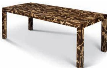
Design Lot 101

Vik Muniz (Brazilian, B. 1961) Anatomy, after Francesco Bertinat (Pictures of Junk) digital chromogenic print 89 x 71 in. (226.1 x 180.3 cm.) Estimate: £10,000–15,000 Muniz incorporates the use of objects such as diamonds, sugar, thread, chocolate syrup and in the present lot's case 'waste' in his practice to create bold, ironic and often deceiving imagery, challenging pre-conceptions of pop culture and art history. in Turin from 1837-39.