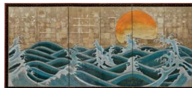
Japanese Lot 41

Studio Job (Founded 2000) Table, from the 'Perished Collection', 2006 produced by Studio Job, the Netherlands, from the edition of 6, one leg inlaid with Job Macassar ebony with laser-cut bird's eye maple marquetry 30 in. (76 cm.) high; 88 in. (225 cm.) wide; 35 in. (90 cm.) deep Estimate: £30,000–50,000 Job Smeets and Nynke Tynagel founded Studio Job in 2000 with a shared vision: a studio with a Renaissance spirit, where traditional and modern techniques are blended to produce superbly crafted and strictly limited editions.