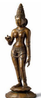
South East Asian Lot 36

Marian Ellis Rowan (1848-1922) A pair of studies of butterflies Estimate: £6,000–10,000