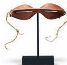
Ethnographical Lot 1

A decorative trophy from the Coldstream Guards Officers' Mess, from the Battle of Waterloo, circa 1815 Estimate: £30,000–50,000 This victory palm leaf displays arms taken from the field of Waterloo. It consists of seventy-six British 1796 patterned light cavalry sabre blades forming a palm frond, while the top is formed from four Infantry Officer's sword tips and a French spontoon blade.