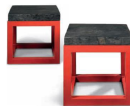
Chinese Lot 86

A Japanese Gilt and Polychrome-Decorated Six-Fold Screen Meiji Period (Late 19th-early 20th century) Estimate: £6,000–10,000 The sun is particularly symbolic in Japanese tradition and the sun is central to the official flag of Japan, this interesting screen therefore celebrates not only Japanese culture but also the traditional earlier art form of ariso byōbu (rough sea screens) which were popular in Japan from the sixteenth century, works which influenced the famous work The Great Wave of Kanagawa by Hokusai.