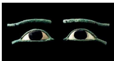
Antiquities Lot 5

A glass model of a Portuguese Man O' War Leopold Blaschka, circa 1877 Estimate: £15,000–25,000 Leopold Blaschka was a Czech jeweller working in Dresden who turned his attention to his passion: natural history. Originally in the collection of The Science Museum, London, having been acquired in 1877, it was deaccessioned in 1925-27.