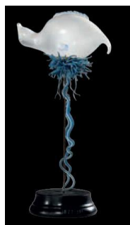
Science and Natural History Lot 46

Two Imperial Chinese dated Suzhou 'Golden Bricks', Qing dynasty, Qianlong Period, dated 1749 and 1784 Estimate: £15,000–25,000 Bricks of this superior quality made for the Imperial Palaces became known as Golden Bricks, possibly because of the metallic sound they made when tapped or more likely due to their high value. Although bricks and tiles had been made in China since 1000 B.C., the craft of making these extremely large, hard wearing, dark and lustrous floor tiles for the royal palaces was a particularly long and complicated process requiring a specific very fine clay from Suzhou.