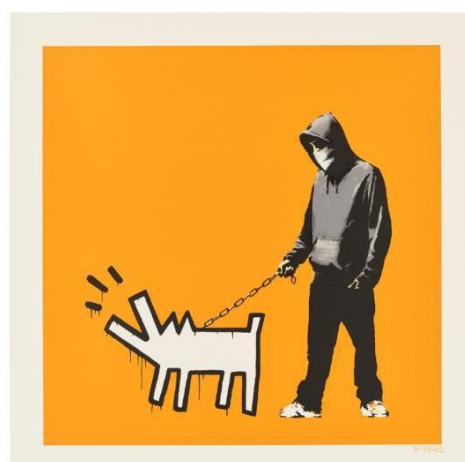
Grayson Perry, Selfie with Political Causes (2018, estimate: £7,000-10,000) and Banksy, Choose Your Weapon (Light Orange) (2010, estimate: £70,000-100,000)