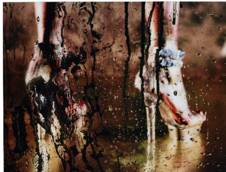
MARILYN MINTER Rorschach chromogenic print face-mounted to acrylic and flush-mounted on aluminum 30 x 40 in. Estimate: $12,000-18,000