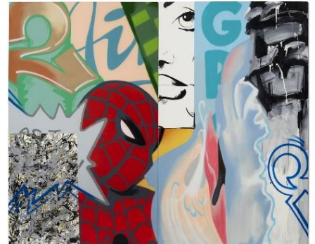
CRASH Rough N' Tumble spray paint and enamel on canvas in two parts overall: 78 x 96 in. Estimate: $15,000-20,000