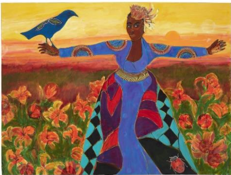
JANET TAYLOR PICKETT The Messenger acrylic and paper collage on canvas 36 x 48 in. Estimate: $30,000-50,000