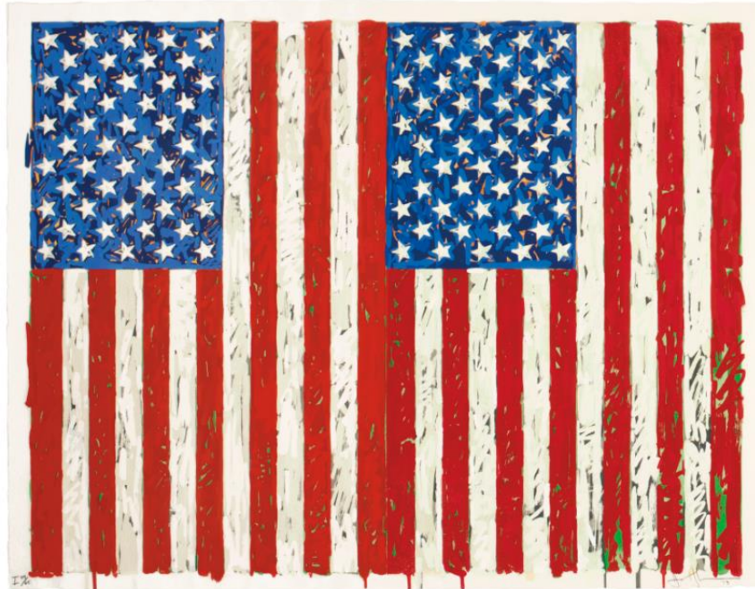
JASPER JOHNS (B. 1930), Flags I , screenprint in colors, on J.B. Green paper, 1973 Estimate: $800,000-1,200,000

New York —Christie's is pleased to announce the two-day sale of Prints & Multiples taking place over three sessions from April 26-27. This diverse sale of over 275 lots and includes a rare selection of early etchings by Joan Miró and master prints by Jasper Johns, Robert Rauschenberg, Roy Lichtenstein, Andy Warhol and Lucian Freud.