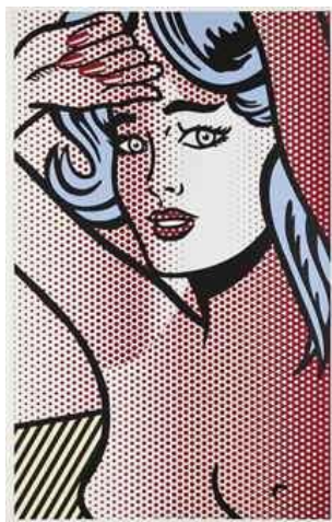
ROY LICHTENSTEIN (1923-1997) Nude with Blue Hair relief print in colors, 1994 Estimate: $350,000-450,000