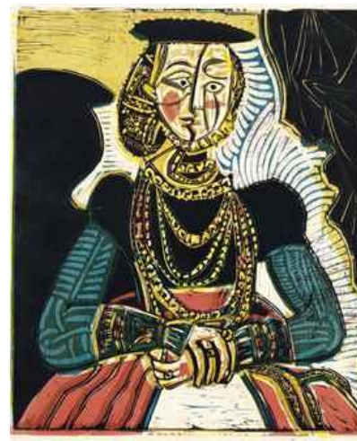
PABLO PICASSO (1881-1973) Buste de femme d'après Cranach le Jeune , linocut in colors, on Arches wove paper, 1958 Estimate: $350,000-450,000