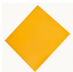
ELLSWORTH KELLY (1923-2015) Orange , lithograph in colors, 2001 Estimate: $8,000-12,000

Prints & Multiples is also pleased to announce the continuation of a robust program of online auctions throughout the Spring season. For regular updates, check the Prints & Multiples Department Page .