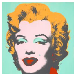
ANDY WARHOL (1928-1987) Marilyn : one plate, screenprint in colors, on wove paper, 1967 Estimate: $100,000-150,000