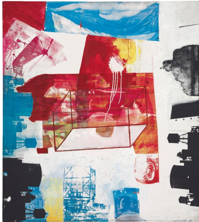
ROBERT RAUSCHENBERG (1925–2008)