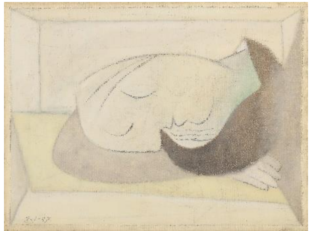
PABLO PICASSO (1881-1973)