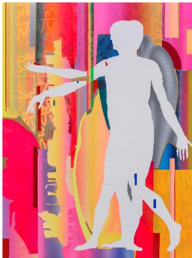
YE LINGHAN (B. 1985)