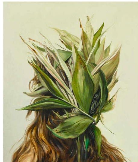
EWA JUSZKIEWICZ (B. 1984)