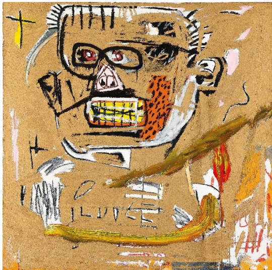
JEAN-MICHEL BASQUIAT (1960-1988)

PRESENTING A DIVERSE SELECTION OF MASTERPIECES FROM TWO KEY ART HUBS