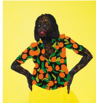
AMOAKO BOAFO (B.1984)