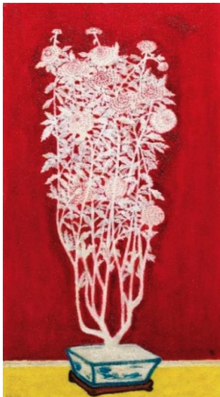
World Auction Record For A Still Life By the Artist

Price Realised: HK$303,985,000 / US$39,181,211 23 November 2019