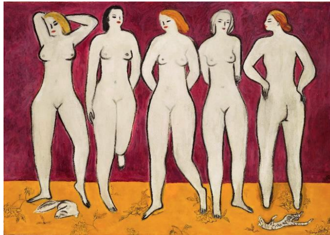
World Auction Record For A Painting Depicting Nudes By the Artist