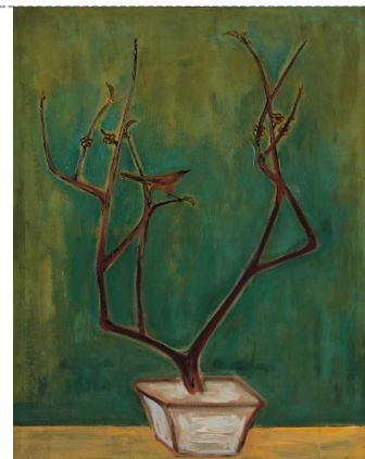
Magpie on a Prunus Branch oil on board 94 x 73.5 cm.