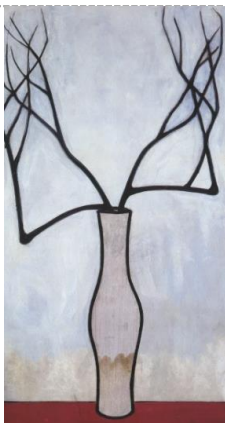
Prunus Branches oil on board 126 x 69 cm.