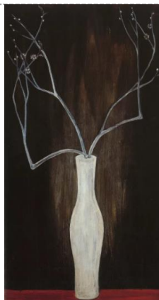
Prunus Blossoms oil on board 126 x 69 cm.