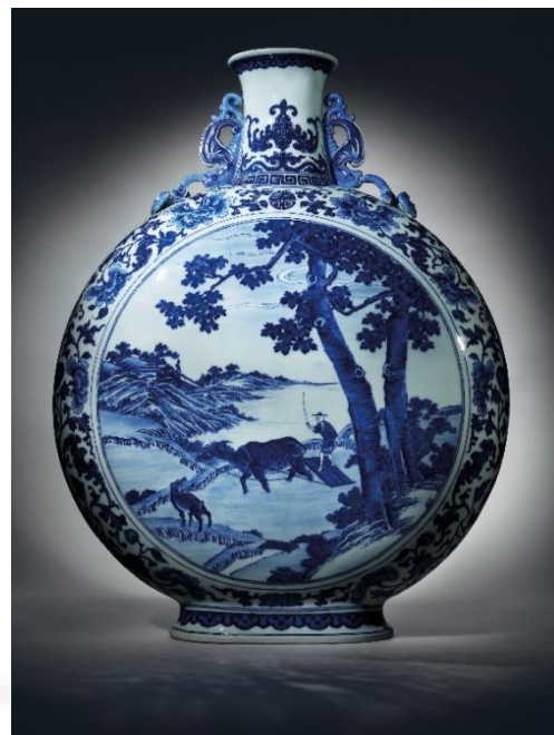
A MAGNIFICENT BLUE AND WHITE MOONFLASK QIANLONG SIX-CHARACTER SEAL MARK IN UNDERGLAZE BLUE AND OF THE PERIOD (1736-1795) 23 1/4 in. (59 cm.) high HK$60,000,000-80,000,000

Hong Kong – Christie's Chinese Ceramics and Works of Art sales will take place on 30 May spanning a total of six auctions with over 270 lots on offer. The highlight of the season are the two single lot sales - Celestial Immortals - The Taber Family Tianqiuping From Philbrook Museum of Art and The Nitta Maitreya along with the much-anticipated themed sales, Contemplating The Divine - Fine Buddhist Art and THREE QIANLONG RARITIES – IMPERIAL CERAMICS FROM AN IMPORTANT PRIVATE COLLECTION , which are complimented by the Important Chinese Ceramics and Works of Art sale.