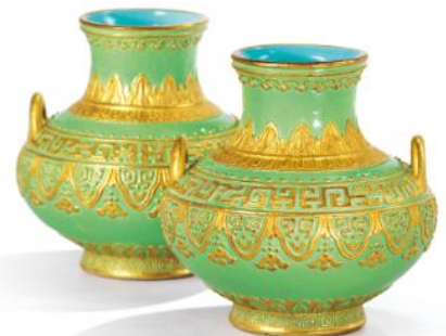
AN EXCEPTIONALLY RARE PAIR OF GILT-DECORATED AND ENAMELED VASES QIANLONG MOULDED SIX-CHARACTER SEAL MARKS AND OF THE PERIOD (1736-1795) 4 in. (10.2 cm.) high 7 1/8 in. (18 cm.) high HK$20,000,000-30,000,000

The Past – In order to consolidate power, the Manchu ruling house embraced the Han Chinese tradition. As with emperors of the past in collecting antiques and archaic bronzes, Qianlong developed a passion for archaism and this is exemplified by the present green enamelled ceramic vases which were made in imitation to the archaic bronzes in Qianlong's own antique collection.