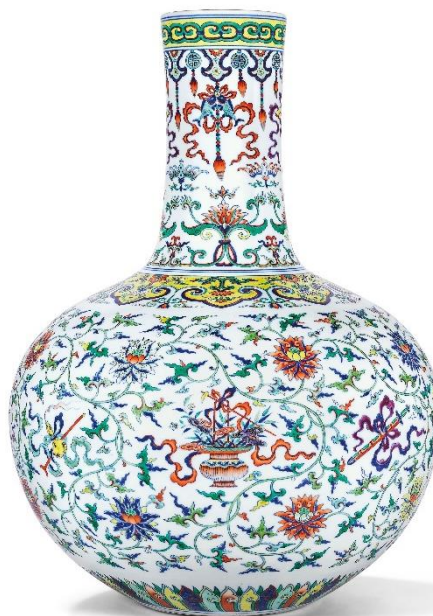
A FINE MAGNIFICENT AND EXTREMELY RARE DOUCAI AND FAMILLE ROSE 'ANBAXIAN' VASE, TIANQIUPING QIANLONG SIX-CHARACTER SEAL MARK IN UNDERGLAZE BLUE AND OF THE PERIOD (1736-1795) 21 1/4 in. (53.9 cm.) high HK$70,000,000-90,000,000