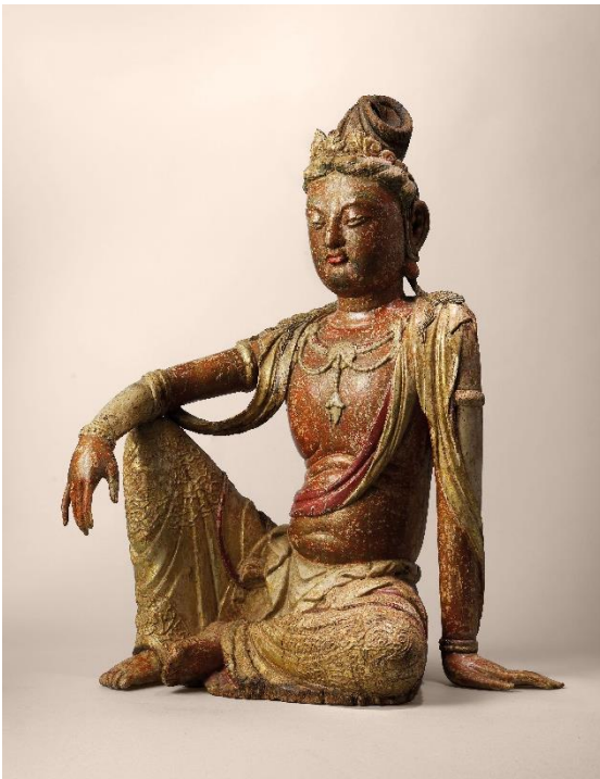
A MAGNIFICENT AND EXTREMELY RARE POLYCHROME WOOD FIGURE OF WATER MOON GUANYIN LIAO-JIN DYNASTY (907-1234) 26 in. (66 cm.) high HK$15,000,000-20,000,000

This themed sale is largely centred around images of bodhisattvas - compassionate beings who have attained enlightenment but who have postponed entry into final nirvana in order to help other sentient beings gain enlightenment. The sale aims to demonstrate how various images of these intermediary bodhisattvas were created throughout time to assist Buddhist followers to contemplate and understand the teachings of the Buddha. From a gilt-bronze figure of Avalokitesvara from the Sui dynasty, to the regal wood figure of Water Moon Guanyin dating to the Liao-Jin dynasty, and a 14 th century Japanese embroidery depicting the bodhisattva Ichiji Kinrin. These deities were depicted in a markedly different style from that of a Buddha, and were intended to be more accessible and to inspire compassion and devotion.