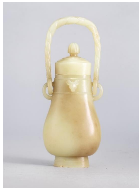
AN IMPORTANT AND EXTREMELY RARE IMPERIAL YELLOW JADE HANGING VASE AND COVER, HETING YOU QIANLONG INCISED FOUR-CHARACTER SEAL MARK AND OF THE PERIOD (1736-1795) 6 in (15.3cm) high HK$12,000,000-18,000,000

For the themed sale Leisurely Delights of A Transient Life , the specialists at Christie's have put together a group of around 90 prized items that reflect the type of objects that would have been suitable for a scholar's studio. These include daily writing utensils made for the scholar's desk, flower vases and incense related implements to decorate the studio, as well as tea or wine drinking vessels and antique objects that reflect the scholarly taste, including some that were specially commissioned for the Imperial studio. These enchanting, playful things are refreshingly modern in their aesthetics and would surely delight anyone with a keen eye for design.