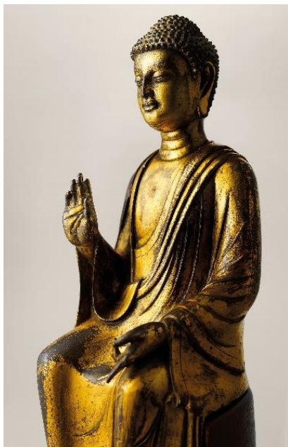
A HIGHLY IMPORTANT GILT-BRONZE FIGURE OF MAITREYA BUDDHA LATE SUI-EARLY TANG DYNASTY, EARLY 7TH CENTURY 12 3/4 in. (32.4 cm) high