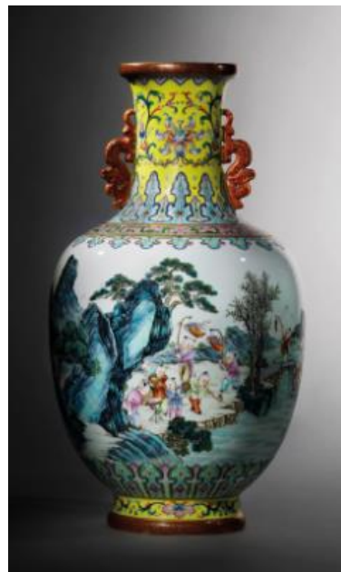
A FINE AND SUPERB YANGCAI YELLOW-GROUND 'BOYS' VASE QIANLONG SIX-CHARACTER SEAL MARK IN IRON RED AND OF THE PERIOD (1736-1795) 15 1/4 in. (38.8 cm.) high HK$50,000,000-80,000,000

The Present – Unquestionably the most immediate concern for an Emperor would be to fulfil his responsibilities as a ruler with the Mandate of Heaven, and thus to consolidate his rule over the Empire. One of the most important rituals conducted by the Emperor was the ceremonial ploughing of the first furrow of the Spring season, performed in the hope of heralding an abundant harvest, and thereby bringing wealth and stability to the nation. The scene of tilling depicted here on this magnificent moonflask conveys a poignant political message: that the Manchu people, who were regarded as outsiders, were in fact legitimate rulers of China and took great interest in the welfare of its people. In essence, this vase was more than merely an object d'art, but a symbol of Imperial rule and legitimacy.