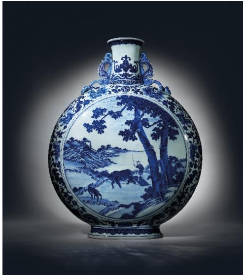
A MAGNIFICENT BLUE AND WHITE MOONFLASK QIANLONG SIX-CHARACTER SEAL MARK IN UNDERGLAZE BLUE AND OF THE PERIOD (1736-1795) 23 1/4 in. (59 cm.) high HK$60,000,000-80,000,000

The Qianlong Emperor named his Imperial studio the 'Hall of Three Rarities', after three prized calligraphy he had collected during his lifetime. This season, Christie's specialists have selected three prized and very rare ceramic pieces in this special themed sale, mirroring the Qianlong Emperor's 'Three Rarities'. These three pieces are emblematic and representative of the ' Three Ages ' of the Qianlong Emperor: