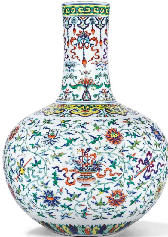
A FINE MAGNIFICENT AND EXTREMELY RARE DOUCAI AND FAMILLE ROSE 'ANBAXIAN' VASE, TIANQIUPING QIANLONG SIX-CHARACTER SEAL MARK IN UNDERGLAZE BLUE AND OF THE PERIOD (1736-1795) 21 1/4 in. (53.9 cm.) high HK$70,000,000-90,000,000

Christie's is honoured to present one of the finest Qing ceramics ever to come to auction – an extremely rare Qianlong Doucai and Famille Rose 'Anbaxian' Vase, Tianqiuping , from Philbrook Museum of Art, Tulsa, Oklahoma.