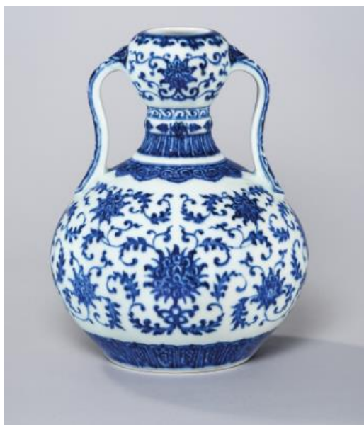
A FINE AND VERY RARE BLUE AND WHITE DOUBLE-GOURD VASE QIANLONG SIX-CHARACTER SEAL MARK AND OF THE PERIOD (1736-1795) 9 1/8 in. (23.3 cm.) high Estimate on Request