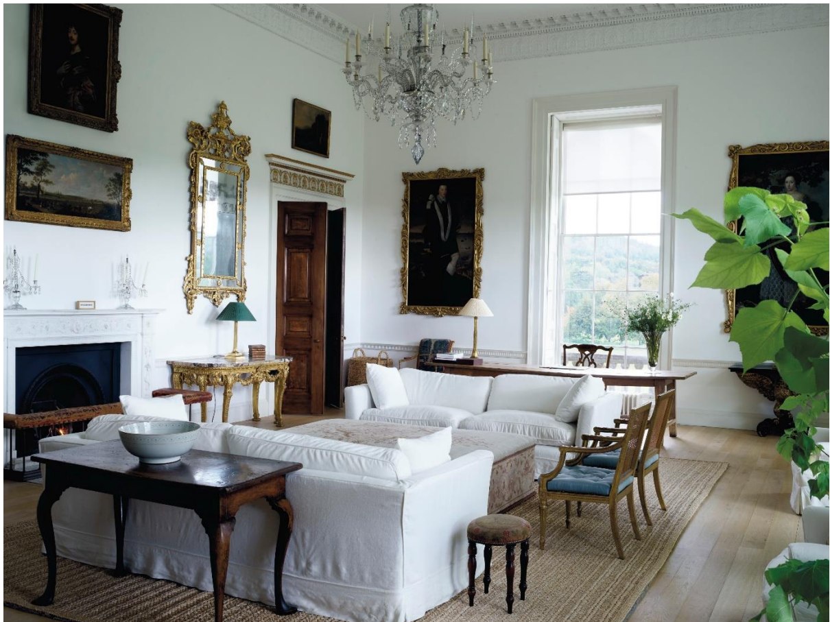
New Wardour Castle: The White Drawing Room

“Time gives an object soul and I find that very attractive.”