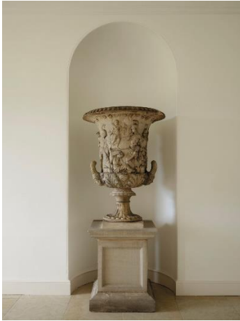
New Wardour Castle: The Medici Vase Estimate: £30,000-50,000

importance of texture, feel and history is tangible in each and every object and on every mellowed surface. The sale of this iconic Collection will be a landmark in the history of English taste and a celebration of all the fabulous interiors that Jasper has created over many years. With estimates starting from £500 up to £800,000, the pre-sale exhibition will be open to the public for all to enjoy from 6 to 13 September, with a late night view on Tuesday 7 September.