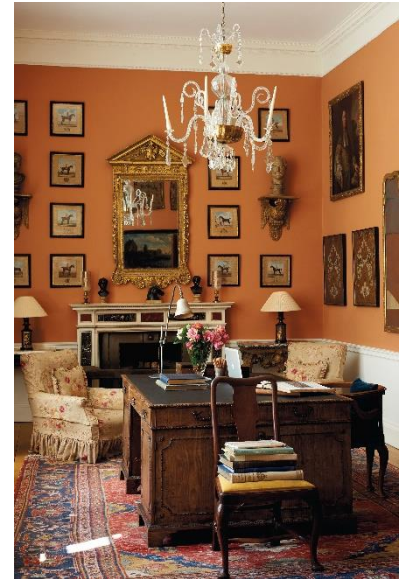
New Wardour Castle: The West Wing Study

simply nowhere to put the collection that I have gathered, so now is the time to part. Am I sad? Yes of course, since there are several rare and precious things with wonderful provenance that I have loved and appreciated living with; HOWEVER I am pragmatic and would much rather these lovely objects go on to have new lives in new homes. They were after all, made to be seen, used and enjoyed."