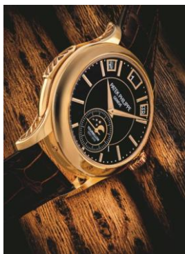
Lot 2379 PATEK PHILIPPE. A RARE 18K PINK GOLD MINUTE REPEATING INSTANTANEOUS PERPETUAL CALENDAR TOURBILLON WRISTWATCH WITH MOON PHASES, DAY/NIGHT AND LEAP YEAR INDICATION REF. 5207, CIRCA 2013

Price realised: HK$6,850,000/ US$882,650