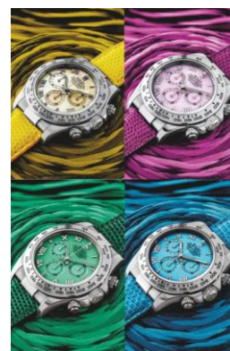
Lot 2205 ROLEX. A GROUP OF FOUR 18K WHITE GOLD AUTOMATIC CHRONOGRAPH WRISTWATCHES WITH YELLOW MOTHER- OF-PEARL, PINK MOTHER-OF-PEARL, TURQUOISE CHRYSOPRASE AND GREEN CHRYSOPRASE DIALS DAYTONA MODEL, REF. 116519, "BEACH", CIRCA 2000 TO 2002 Price realised: HK$2,250,000/ US$289,922

Price realised: HK$5,000,000/ US$644,270