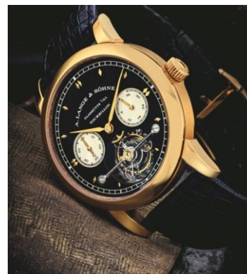
Lot 2248 A. LANGE & SÖHNE. AN EXTREMELY RARE 18K PINK GOLD LIMITED EDITION TOURBILLON WRISTWATCH WITH CHAIN FUSÉE AND POWER RESERVE POUR LE MÉRITE MODEL, LIMITED EDITION TO 150 PIECES, REF. 701.011, CIRCA 1999 Price realised: HK$3,250,000/ US$418,776

Image download link: please click here .