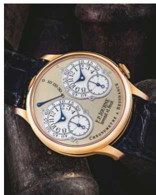
PROPERTY FROM THE CHAMPION COLLECTION LOT 2217 F.P. JOURNE. AN EARLY 18K PINK GOLD DUAL TIME CHRONOMETER WRISTWATCH WITH RESONANCE- CONTROLLED TWIN INDEPENDENT GEAR-TRAIN MOVEMENT AND POWER RESERVE CHRONOMÈTRE À RÉSONANCE MODEL, CIRCA 2002 Price realised: HK$3,000,000/ US$386,562