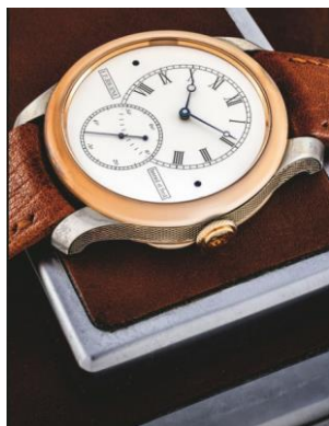
PROPERTY FROM THE CHAMPION COLLECTION Lot 2214 F.P. JOURNE. AN 18K PINK GOLD AND SILVER LIMITED EDITION TOURBILLON WRISTWATCH, MADE TO CELEBRATE THE 30TH ANNIVERSARY OF F.P. JOURNE 30 YEAR ANNIVERSARY TOURBILLON MODEL, LIMITED EDITION TO 99 PIECES, CIRCA 2013 Price realised: HK$3,250,000/ US$418,776