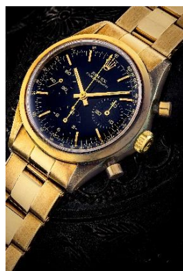
Lot 2333 ROLEX. A VERY RARE 14K CHRONOGRAPH WRISTWATCH WITH BRACELET, REF. 6238, CIRCA 1967

Price realised: HK$5,250,000/ US$676,484