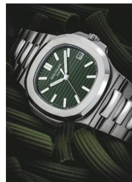
Lot 2355 PATEK PHILIPPE. A VERY RARE STAINLESS STEEL AUTOMATIC WRISTWATCH WITH SWEEP CENTRE SECONDS, DATE, BRACELET AND OLIVE GREEN DIAL NAUTILUS MODEL, REF. 5711, CIRCA 2021

Price realised: HK$5,625,000/ US$724,804