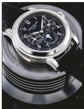
Lot 2378 PATEK PHILIPPE. A RARE PLATINUM AUTOMATIC "CATHEDRAL" MINUTE REPEATING PERPETUAL CALENDAR WRISTWATCH WITH MOON PHASES, 24 HOUR AND LEAP YEAR INDICATION REF. 5074, CIRCA 2012

Price realised: HK$6,850,000/ US$882,650