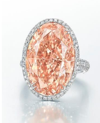
20.02 CARAT FANCY BROWNISH ORANGY PINK VVS2 DIAMOND RING Estimate: HK$9.3 Million – 12 Million US$1.2 Million – 1.5 Million