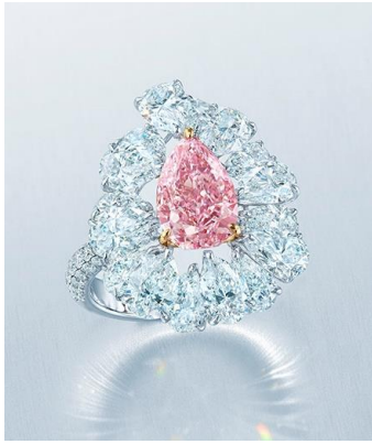
2.02 CARAT FANCY VIVID PURPLE-PINK DIAMOND RING Estimate: HK$7 Million – 9 Million US$900,000 – 1.15 Million