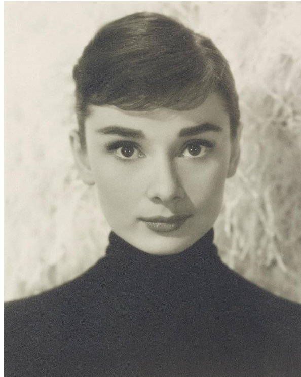
Audrey Hepburn, circa 1957

London – Christie's will present the sale of the personal collection of Audrey Hepburn, the globally renowned and celebrated film and stage actress, fashion legend and humanitarian in London this September. The collection of one of the most famous and beloved stars in the history of film and fashion will be showcased in a flagship auction at Christie's King Street headquarters in London on 27 September, alongside an online sale which will be open for bidding from 19 September until 3 October. The collection is an extraordinary archive chronicling the life and career of arguably the most famous screen actress of the 20 th Century through the lens of the objects she collected, used and loved. This is the first time these remarkable, personal items, which have remained in the ownership of Audrey Hepburn's family, have been offered for sale. The collection will be on view to the public in an exhibition at Christie's King Street, London from 23 September.