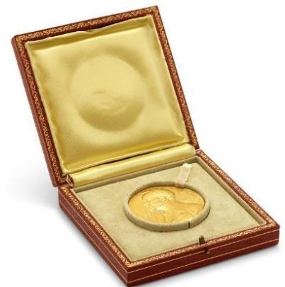
The IVF Nobel Medal [Sir Robert Geoffrey EDWARDS (1925-2013)] – Nobel Prize Medal, 2010 Estimate: £500,000-800,000