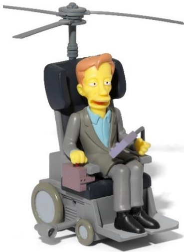
Stephen Hawking's personal Simpsons portrait Stephen Hawking. 2003 Estimate: £500-800

Following Christie's successful sale of personal items from the estate of Professor Stephen Hawking in 2018's inaugural online auction On the Shoulders of Giants which were 100% sold, bidders will also have the opportunity to purchase a number of unique items directly offered from the late physicist's estate. Highlights include a rare Hawking portrait by Anton Corbijn, the creative director best known for the visual output of Depeche Mode and U2 (estimate: £1,000-1,500), and a Simpsons figurine of him made by Playmates Toys ( illustrated left , estimate: £500-800). These rare items provide a remarkable insight into the cultural interests, personality and sense of fun of this extraordinary man.