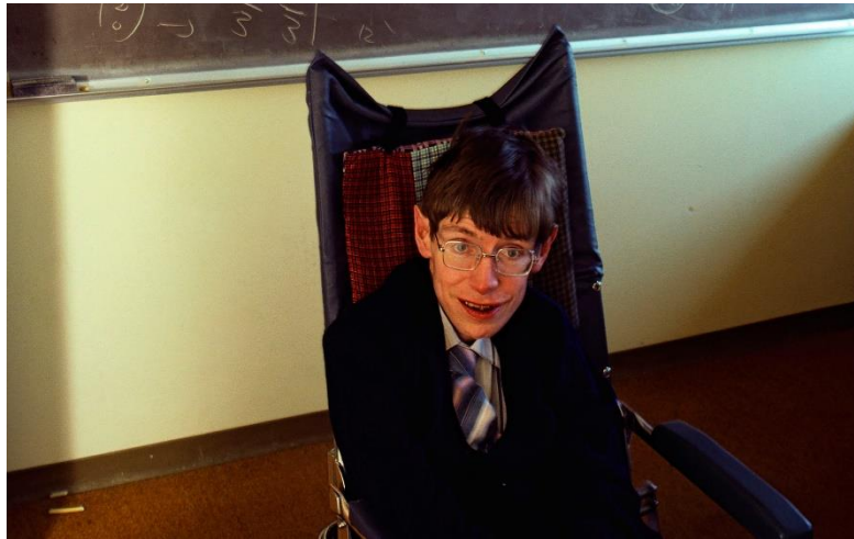
Douglas Kirkland (b.1934, photographer). Stephen Hawking . 1 March 1983.

AN ONLINE SALE HIGHLIGHTING THE SCIENTIFIC BREAKTHROUGHS OF THE 20 th CENTURY