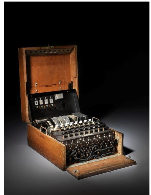
A Second World War Enigma Machine A four-rotor Enigma Cipher Machine, Olympia Büromaschinenwerke Estimate: £200,000-300,000