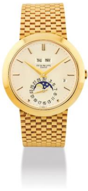
LOT 2475 PATEK PHILIPPE.

A STAINLESS STEEL CHRONOGRAPH WRISTWATCH WITH BRACELET AND PAUL NEWMAN DIAL, PAUL NEWMAN MODEL, REF. 6239, CIRCA 1967 HK$1,200,000 – 2,000,000/ US$160,000 – 260,000