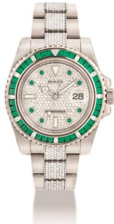
LOT 2355 ROLEX.

AN 18K GOLD AND DIAMOND-SET AUTOMATIC CHRONOGRAPH WRISTWATCH WITH RAINBOW-COLOURED MULTI-GEM SET BEZEL AND BRACELET, COSMOGRAPH DAYTONA RAINBOW MODEL, REF. 116598RBOW, CIRCA 2017 HK$1,700,000 – 2,400,000/ US$220,000 – 310,000