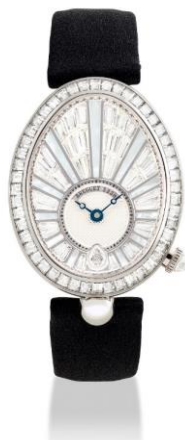
LOT 2373 BREGUET.

AN ATTRACTIVE 18K WHITE GOLD AND BAGUETTE-CUT DIAMOND-SET SEMI-SKELETONISED CHRONOGRAPH WRISTWATCH, CLASSIQUE MODEL, REF. 5238, CIRCA 2008 HK$720,000 – 1,100,000/ US$93,000 – 140,000