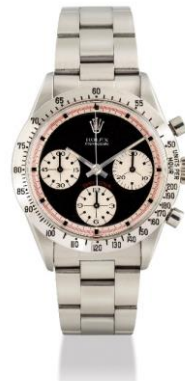
LOT 2513 ROLEX.

AN 18K GOLD AUTOMATIC TRIPLE CALENDAR WRISTWATCH WITH MOON PHASES AND "PYRAMID" DIAL, REF. 6062, CIRCA 1953 HK$1,700,000 – 2,400,000/ US$220,000 – 310,000