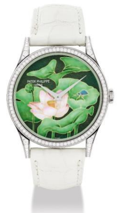
LOT 2304 PATEK PHILIPPE.

AN 18K WHITE GOLD AND BAGUETTE DIAMOND-SET OVOID-SHAPED AUTOMATIC WRISTWATCH WITH MOTHER-OF-PEARL DIAL, REINE DE NAPLES MODEL, REF. 8939, CIRCA 2008 HK$600,000 – 1,000,000/ US$77,000 – 130,000