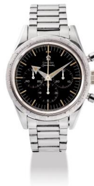
LOT 2453 OMEGA.

A VERY RARE 18K GOLD AUTOMATIC TRIPLE CALENDAR WRISTWATCH WITH MOON PHASE, REF. 8171, CIRCA 1950 HK$800,000 – 1,600,000/ US$110,000 – 210,000