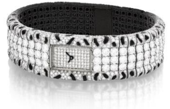
LOT 2362 CARTIER.

AN 18K WHITE GOLD, EMERALD AND DIAMOND-SET AUTOMATIC WRISTWATCH WITH SWEEP CENTRE SECONDS, DATE AND BRACELET, SUBMARINER MODEL, REF. 116649EMBR, CIRCA 2017 HK$1,700,000 – 2,400,000/ US$220,000 – 310,000