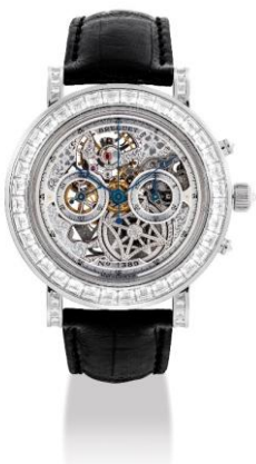
LOT 2374 BREGUET.

A LADY'S PLATINUM, DIAMOND AND ONYX-SET BRACELET WATCH, CIRCA 1995 HK$900,000 – 1,500,000/ US$120,000 – 190,000