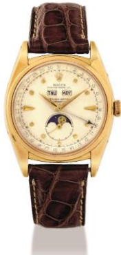
LOT 2504 ROLEX.

A STAINLESS STEEL CHRONOGRAPH WRISTWATCH WITH BRACELET AND PAUL NEWMAN PANDA DIAL, OYSTER PERPETUAL, COSMOGRAPH, PAUL NEWMAN PANDA MODEL, REF. 6263, CASE NO. 2'200'306, CIRCA 1969 HK$1,750,000 – 3,200,000/ US$230,000 – 410,000