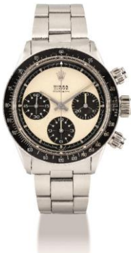
LOT 2515 ROLEX.

A STAINLESS STEEL CHRONOGRAPH WRISTWATCH WITH BRACELET AND PAUL NEWMAN PANDA DIAL, OYSTER PERPETUAL, COSMOGRAPH, PAUL NEWMAN PANDA MODEL, REF. 6263, CASE NO. 2'200'306, CIRCA 1969 HK$1,750,000 – 3,200,000/ US$230,000 – 410,000