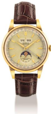
LOT 2483 ROLEX.

AN 18K GOLD AUTOMATIC PERPETUAL CALENDAR BRACELET WATCH WITH MOON PHASES AND ROMAN LEAP YEAR INDICATION, REF. 3450/1, MANUFACTURED IN 1985 HK$1,000,000 – 1,500,000/ US$130,000 – 190,000