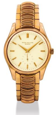
LOT 2476 PATEK PHILIPPE.

A STAINLESS STEEL CHRONOGRAPH BRACELET WATCH, BROAD ARROW MODEL, REF. 2915, MANUFACTURED IN 1958 HK$600,000 – 960,000/ US$77,000 – 120,000