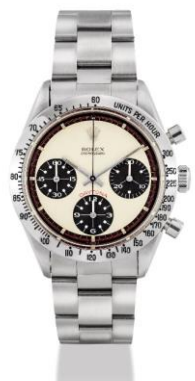
LOT 2514 ROLEX.

A STAINLESS STEEL CHRONOGRAPH WRISTWATCH WITH BRACELET AND PAUL NEWMAN DIAL, COSMOGRAPH, DAYTONA, PAUL NEWMAN MODEL, REF. 6239, CASE NO. 1'958'575, CIRCA 1969 HK$1,200,000 – 2,000,000/ US$160,000 – 260,000