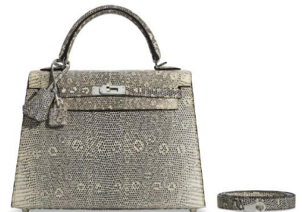
HERMÈS, 2010 A RARE, SHINY OMBRÉ SALVATOR LIZARD SELLIER KELLY 25 WITH PALLADIUM HARDWARE $24,000-30,000