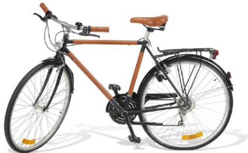
HERMÈS, 1994 A LE FLÂNEUR D'HERMÈS BICYCLE $1,000-2,000