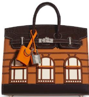
HERMÈS A RARE, MATTE ÉBÈNE ALLIGATOR, GOLD MADAM, ORANGE H SWIFT, BRULEE & ÉBÈNE SOMBRERO, CRAIE EPSOM LEATHER FAUBOURG SELLIER BIRKIN 20 WITH PALLADIUM HARDWARE $80,000-100,000