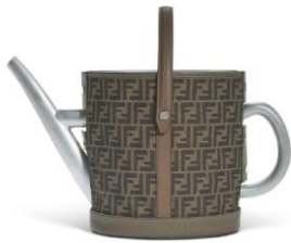
FENDI, 2020 A WATERING CAN $1,500-2,400