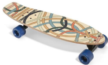
HERMÈS, 2017 A CAVALCADOUR VOSGES MAPLE SKATEBOARD $2,000-3,000