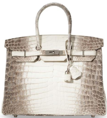
HERMÈS, 2015 A RARE, MATTE WHITE HIMALAYA NILOTICUS CROCODILE BIRKIN 35 WITH PALLADIUM HARDWARE $80,000-100,000