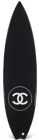
CHANEL A BLACK CARBON FIBER SURFBOARD $8,000-10,000