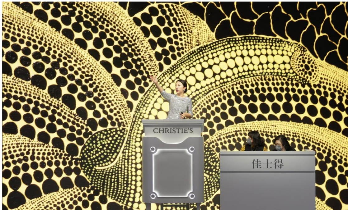
Yayoi Kusama's Pumpkin (LPASG) Sets a New World Auction Record for the Artist in the Evening Sale:

24 Artist World Auction Records Established