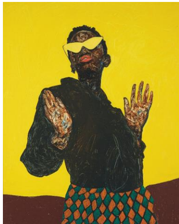
AMOAKO BOAFO Hands Up

Price Realised: HK$26,650,000/ US$3,434,132