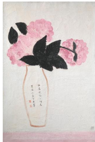
20 th Century Art Day Sale SANYU Untitled (Pink Hydrangeas)

Price Realised: HK$33,850,000/ US$4,361,928