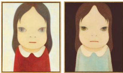
21 st Century Art Day Sale YOSHITOMO NARA & HIROSHI SUGITO White Light; & White Night

Price Realised: HK$33,850,000/ US$4,361,928