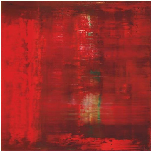
GERHARD RICHTER Abstraktes Bild 747-1

Price Realised: HK$140,400,000/ US$18,092,014