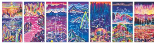
HUANG YUXING Seven Treasure Pines

Against its pre-sale low estimate of HK$2,000,000/ US$257,721