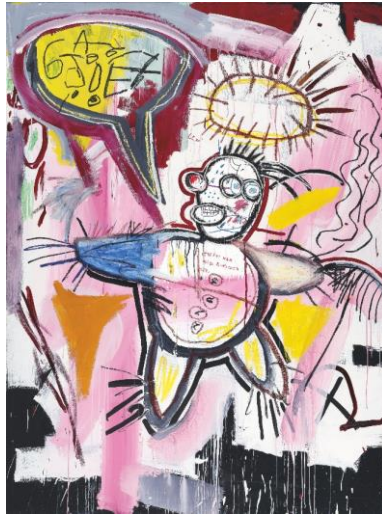
JEAN-MICHEL BASQUIAT Donut Revenge

Price Realised: HK$140,400,000/ US$18,092,014