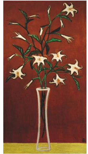
SANYU Vase de lys sur fond marron ( Vase of Lilies with Red Ground )

Price Realised: HK$163,300,000/ US$21,042,920