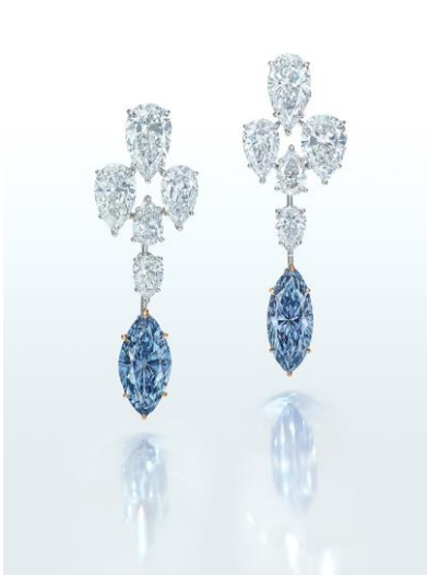
3.29 CT EACH FANCY INTENSE BLUE INTERNALLY FLAWLESS DIAMOND EARRINGS

Price Realised: HK$47,050,000/ US$6.1 million