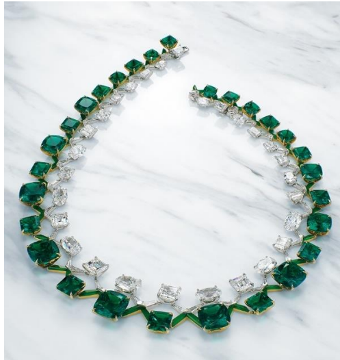
Top Lot of the Sale BOGHOSSIAN EMERALD AND DIAMOND DOUBLE RIVIÈRE NECKLACE, DESIGNED BY EDMOND CHIN

Price Realised: HK$47,050,000/ US$6.1 million