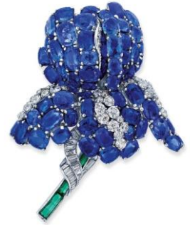
SAPPHIRE, DIAMOND AND EMERALD CARTIER BROOCH

Price Realised: HK$15,850,000/ US$2.1 million