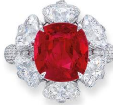
5.05 CT BURMESE RUBY RING

Price Realised: HK$13,930,000/ US$1.8 million