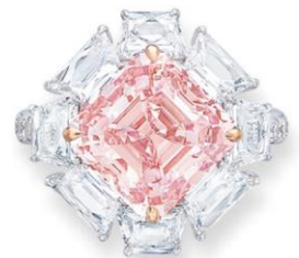
4.90 CT FANCY INTENSE PINK/VS1 DIAMOND RING

Price Realised: HK$54,250,000/ US$7 million