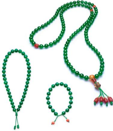
A SET OF JADEITE BEAD JEWELLERY

Price Realised: HK$13,930,000/ US$1.8 million