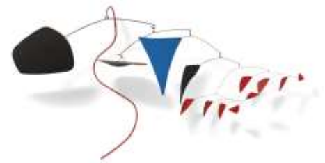
Alexander Calder, Le Serpent Rouge (The Red Snake) , 1958, Estimate: £2,000,000-300,000

At the core of the collection is Jean Dubuffet's Visiteur au chapeau bleu avril , (1955, estimate: £2,000,000-3,000,000) one of the raw, highly textured canvases that Dubuffet produced during the first few months of his six-year sojourn in the south of France and presents a vision of bucolic joie de vivre. Other highlights include Francis Picabia's Lampe , (1923, estimate: £800,000-1,500,000); and Agnes Martin's Praise , (1985, estimate: £2,000,000-3,000,000) an example of Martin's serene visual vocabulary, which she employed to evoke pure, meditative states of mind. Another focal point of the collection is Alexander Calder's Le serpent rouge (The Red Snake) , (1958, estimate: £2,000,000-3,000,000, illustrated right ), spanning two metres in width the mobile presents a hypnotic cascade of red, blue and black biomorphic forms, elegantly emerging from the wall with twisting serpentine movement.