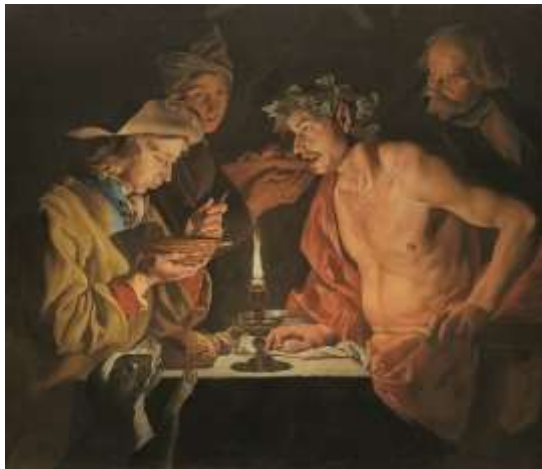
Matthias Stomer, Blowing Hot, Blowing Cold , Estimate: £400,000-600,000

Completing this survey of the development of London taste-making and impact on the international art world, Abso-bloody-lutely! , an auction in three parts: Post-War and Contemporary Art Evening and Day Auctions (6 and 7 October) and online (4-13 October), will present art that encapsulates the two decades in London that heralded the arrival of Tate Modern, Frieze Art Fair, Artangel and the Fourth Plinth project in Trafalgar Square. The Cranford Collection was established to nurture the capital's artists and encourage creativity which is represented by the work of Damien Hirst, Glenn Brown, Gillian Wearing, Rachel Whiteread and Francis Alÿs, amongst others. London's position as a global centre for art has been shaped by these visionary figures whose private collections provide a glimpse into the tastes that spanned and defined five decades in the history of the city.