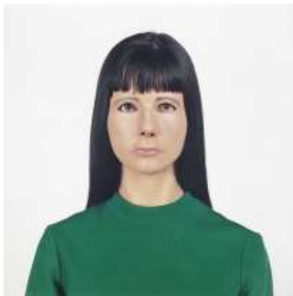
Gillian Wearing, Self Portrait , 2000, Estimate: £15,000-20,000

Abso-bloody-lutely! is an eclectic collection of works encapsulating two of the most exciting decades in British art history. From the YBAs to more conceptual artists, this selection of works from the Cranford Collection spans a wide range of media. Whether incendiary images or apparitions of subtle beauty, the works all share a distinctively London tone of fun and irreverence. Damien Hirst's Salvation (2003, estimate: £250,000-350,000) and Damnation (2004, estimate: £180,000-220,000) is an enthralling double vision of life and death. Two sharp triangular frames are filled with insects, to dramatically different effect. Salvation forms a beautiful display of butterflies fixed in blue paint; arranged in a kaleidoscopic, radial pattern and their wings gleaming with facets of wildly varied iridescent colour, they resemble a gorgeous stained-glass window. Damnation , in stark contrast, is a void of solid and compelling darkness, formed by the massed bodies of thousands of black flies in resin. Hirst stated that an absence of God meant