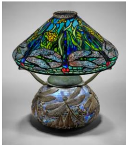
TIFFANY STUDIOS EARLY AND RARE 'DRAGONFLY AND WATERFLOWERS' TABLE LAMP, CIRCA 1900 leaded glass, mosaic Favrile glass, patinated bronze 17 \frac{3}{4} in. (45.1 cm) high, 16 in. (40.6 cm) diameter of shade $350,000-500,000