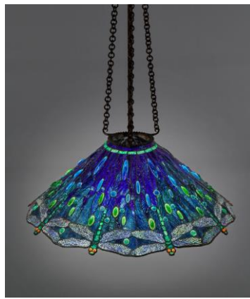
TIFFANY STUDIOS IMPORTANT AND RARE 'HANGING HEAD DRAGONFLY' CHANDELIER, CIRCA 1905 with original hanging fixture 10½ in. (26.7 cm) high, 28 in. (71.1 cm) diameter, 60 in. (152.4 cm) $600,000-800,000