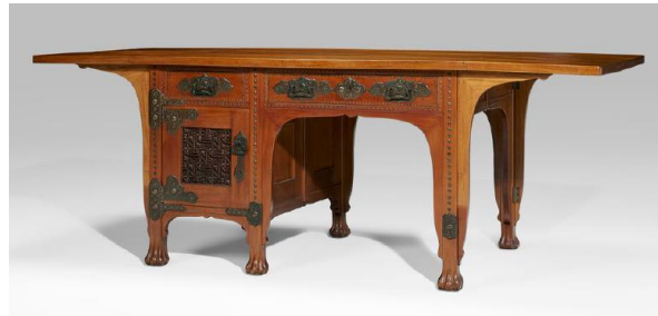
LOUIS C. TIFFANY AND ASSOCIATED ARTISTS DROP-LEAF PARTNER'S DESK FOR THE WILLIAM S. KIMBALL RESIDENCE, ROCHESTER, NEW YORK, CIRCA 1881 canary wood, teak, patinated copper 30 \frac{1}{4} x 84 \frac{3}{8} x 36 in. (76.8 x 214.3 x 91.4 cm) (extended) 50 \frac{1}{2} in. wide (128.3 cm) (unextended) $40,000-60,000