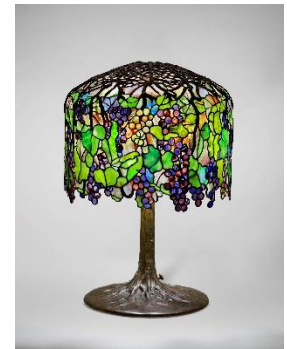
TIFFANY STUDIOS RARE 'ELABORATE GRAPE' TABLE LAMP, CIRCA 1903 leaded glass, patinated bronze 27 in. (68.6 cm) high, 18 in. (45.7 cm) diameter of shade $300,000-500,000