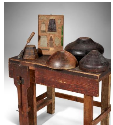
TIFFANY STUDIOS WORKBENCH AND TOOLS FROM THE FORMER COLLECTION OF JOHN DIKEMAN, CIRCA 1932 33 x 28 x 45 in. (83.8 x 71.1 x 114.3 cm) $50,000-70,000