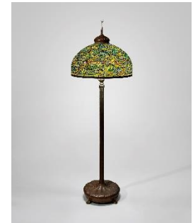
TIFFANY STUDIOS RARE 'YELLOW ROSE' FLOOR LAMP, CIRCA 1905 leaded glass, gilt bronze 78 \frac{1}{2} in. (199.4 cm) high, 26 in. (66 cm) diameter of shade $600,000-800,000