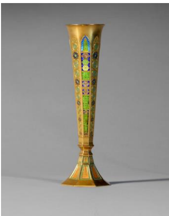
TIFFANY & CO. IMPORTANT VASE, 1911 22K gold, champlevé and plique-à-jour enamel 10¾ in. (27.3 cm) high, 3½ in. (8.9 cm) diameter $40,000-60,000