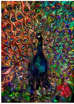
TIFFANY STUDIOS 'PEACOCK' WINDOW, CIRCA 1910-1915 Favrile glass 31 in. (78.7 cm) high, 22 \frac{7}{8} in. (58.1 cm) wide (sight) $200,000-300,000