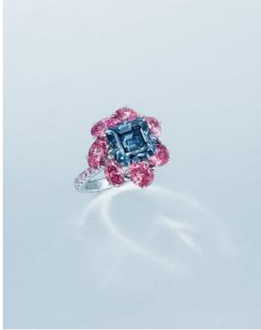
A 3.24 CARAT FANCY VIVID BLUE/IF DIAMOND RING BY MOUSSAIEFF PRICE REALIZED: HK$53,717,500 /US$6,893,880