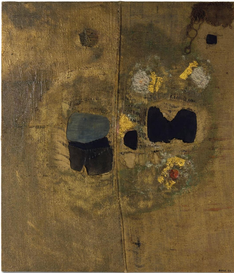
Alberto Burri, Sacco (1953, estimate: £3,000,000-5,000,000)

London – Christie's Thinking Italian Evening Auction will take place during Frieze Week on 4 October 2019 and directly follows the Post-War and Contemporary Art Evening Auction . The auction will be led by Alberto Burri's Sacco (1953, estimate: £3,000,000-5,000,000), a rare, early example of the artist's famed Sacchi , the iconic series that he began in 1950 and by an early steel work by Lucio Fontana that encapsulates the artist's exploration of space, Concetto spaziale (1954, Estimate on Request). 'Art for Future, Selected Works from the UniCredit Group' will be presented across both evening auctions with Enrico Castellani and Giuseppe Gallo starring in Thinking Italian . Mario Schifano's oeuvre during the