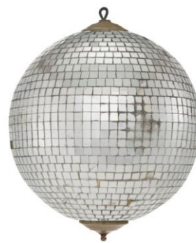
A 12 INCH DISCO BALL FROM 1520 SEDGWICK AVENUE UNKNOWN, CA. 1970 PRICE REALIZED: $37,800