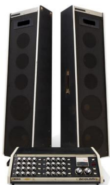
8 CHANNEL MODEL 850 MIXER WITH TWO MODEL 804 TRANSDUCER SPEAKER CABINETS PRICE REALIZED: $107,100