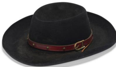
A STETSON HAT WORN IN THE MOVIE BEAT STREET, 1984 PRICE REALIZED: $35,280