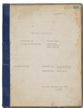
KOOL HERC’S PERSONAL COPY OF THE SCRIPT FOR THE FILM BEAT STREET PRICE REALIZED: $37,800