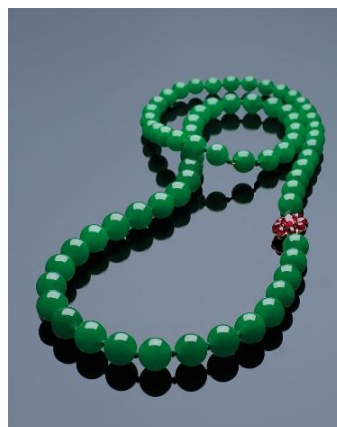
The 'Heavenly Twins' an Exceptional Jadeite Sautoir bead Necklace Estimate: HK$55,000,000- 85,000,000