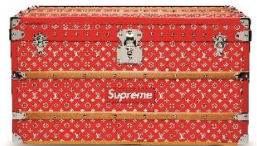
A Limited Edition Red & White Monogram Malle Courier 90 Trunk With Silver Hardware by Supreme, Louis Vuitton, 2017 Estimate : HK$400,000-500,000