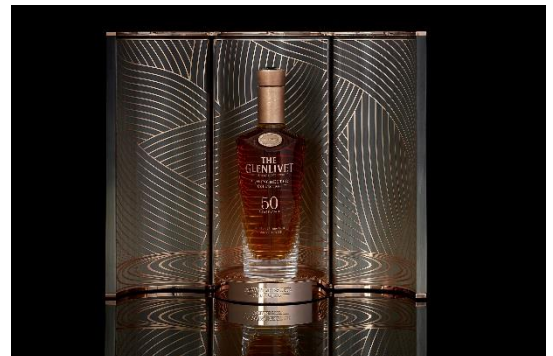
The Glenlivet 50 Year-Old Winchester Collection 1967 1 bottle per lot HK$150,000 – 200,000/US$19,000 – 26,000