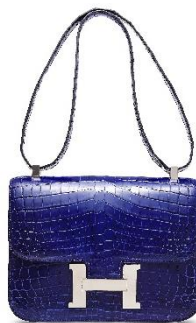
A Shiny Bleu Électrique Niloticus Crocodile Constance With Palladium Hardware, Hermès, 2012 Estimate: HK$100,000-150,000