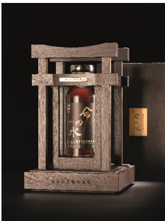
Karuizawa "Aqua of Life" 50 Year Old 1 bottle per lot HK$300,000 – 450,000/US$38,000 – 55,000

Leading the spirits section of the auction will be a selection of fine Whiskies including the rare Karuizawa "Aqua of Life" 50 Year Old and The Glenlivet 50 Year-Old Winchester Collection.