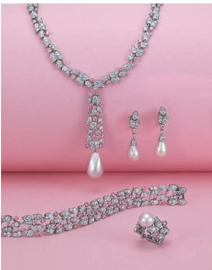
Natural pearl and diamond suite, Cartier Estimate: HK$8,000,000 – 12,000,000