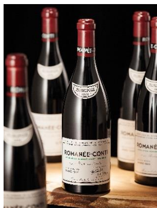
Domaine de la Romanée-Conti, Romanée-Conti 1999 6 bottles per lot, Estimate: HK$700,000- 1,100,000