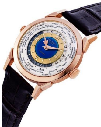
Patek Philippe A one-of-a-kind and Highly Important 18K Pink Gold Two-Crown World Time Wristwatch With 24 Hour Indication And Double-Signed Blue Enamel Dial, Retailed By Gobbi, Milan, "L'Heure Bleue", REF. 2523, Manufactured IN 1953 Estimate: HK$ 55,000,000-110,000,000