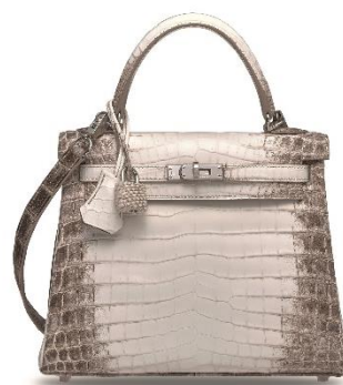
A Rare, Matte White Niloticus Crocodile Himalaya Retourné Kelly 25 With Palladium Hardware Hermès, 2019 Estimate: HK$600,000-800,000

Hong Kong - November, Christie's Hong Kong Luxury auctions will present collectors with the very best in wines and spirits, extraordinary jewels, important watches and exceptional handbags. Highlights of the auctions include fine collections of Bordeaux, Burgundy and Tuscan wines, an exceptional Jadeite Sautoir named the 'Heavenly Twins', the only known Patek Philippe ref. 2523 retailed by Gobbi, Milan and a Matte White Niloticus Crocodile Himalaya Retourné Hermès Kelly 25 with palladium hardware.