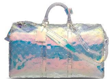
A Limited Edition Iridescent Prism Monogram Keepall Bandoulière 50 With White Hardware by Virgil Abloh, Louis Vuitton, 2019 Estimate: HK$15,000-20,000