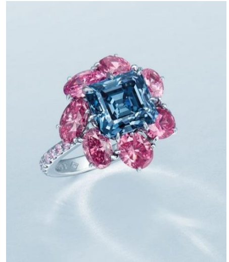
3.24 cartas fancy vivid blue/IF diamond ring by Moussaieff Estimate: HK$44,500,000 – 60,000,000