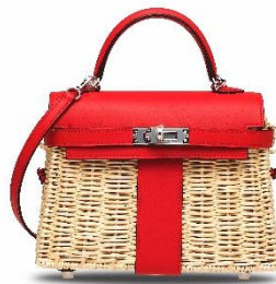
A Limited Edition Rare, Rouge De Coeur Swift Leather & Osier Mini Picnic Kelly With Palladium Hardware, Hermès, 2019 Estimate: HK$150,000-200,000