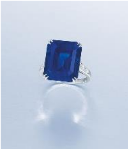
16.04 carats Kashmir no heat sapphire ring, Tiffany & Co. Estimate: HK$12,800,000 – 18,000,000

On 26 November, Christie's Hong Kong Magnificent Jewels auction will present an outstanding selection of the best gemstones, including D Flawless diamonds, fancy vivid diamonds, jadeite, Kashmir sapphires, Burmese rubies and pearls. Signed jewellery will star in the auction with designs by the most coveted jewellery houses including Cartier, Tiffany & Co, Van Cleef & Arpels and Harry Winston. Leading the auction will be the 'Heavenly Twins', an exceptional Jadeite Sautoir (estimate: HK$55,000,000 – 85,000,000). Further highlights include a superb pair of diamond earrings, D colour, Internally Flawless clarity, of over 17 carats each (estimate: HK$22,000,000-30,000,000), a pair of Fancy Vivid Yellow diamond earrings, of over 8 carats each (estimate: HK$8,500,000-12,000,000), an exceptional Kashmir sapphire ring of over 16 carats by Tiffany & Co (estimate: HK$12,800,000-18,000,000) and a natural pearl, pink diamond and diamond suite by Cartier (estimate: HK$8,000,000-12,000,000). Another focal point of the season is a 3.24 cartas fancy vivid blue/IF diamond ring by Moussaieff (estimate: HK$44,500,000 – 60,000,000,), which continues Christie's tradition of offering only the most coveted coloured diamonds in the world.