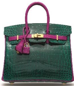
A Custom Shiny Vert Émeraude & Rose Schéhérazade Niloticus Crocodile Birkin 25 With Brushed Gold Hardware, Hermès, 2018 Estimate: HK$400,000-500,000

Christie's Handbags & Accessories auction on 25 November will feature 257 of the most sought-after handbags and accessories, with estimates from HK$10,000-HK$800,000. Headlining the auction will be a Matte White Niloticus Crocodile Himalaya Retourné Hermès Kelly 25 With Palladium Hardware, 2019, (estimate: HK$600,000-800,000), demonstrating the height of craftsmanship and exotic expertise. Limited edition and custom pieces will highlight the auction including a Matte Black Niloticus Crocodile so Black Hermès Birkin 35 With Black Pvd Hardware, 2018 (estimate: HK$300,000-350,000) and a custom Shiny Vert Émeraude & Rose Schéhérazade Niloticus Crocodile Hermès Birkin 25 With Brushed Gold Hardware, 2018 (estimate: HK$400,000-500,000). For collectors of Louis Vuitton, the auction will present limited editions collaborations by Supreme and Virgil Abloh including a Red & White Monogram Malle Courier 90 Trunk With Silver Hardware by Supreme and Louis Vuitton, 2017, (estimate: HK$400,000-500,000) and a limited edition pieces by Virgil Abloh and Louis Vuitton, an iridescent Prism Monogram Keepall Bandoulière 50 With White Hardware, (estimate: HK$15,000-20,000).