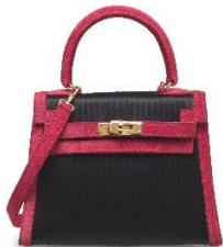
A Rare, Black Ribbed Satin & Fuchsia Veau Doblis Mini Plisse Kelly With Gold Hardware, Hermès, 1999 Estimate: HK$100,000-150,000