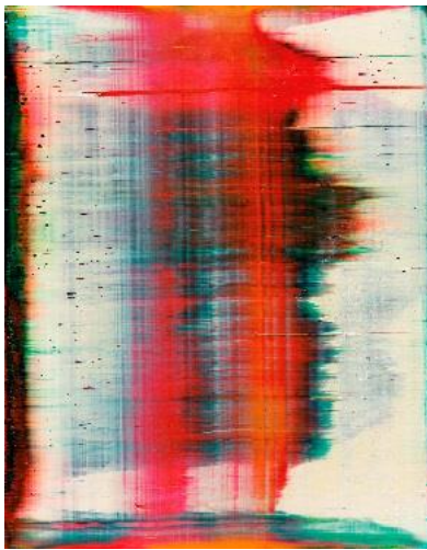
Gerhard Richter FUJI