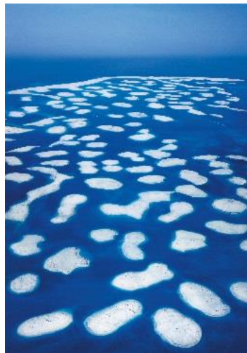
Andreas Gursky DUBAI WORLD 1