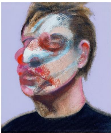
FRANCIS BACON (1909-1992) Two Studies for a Self-Portrait oil on canvas, in two parts each: 14 x 12 in. (35.5 x 30.5 cm.) Painted in 1970