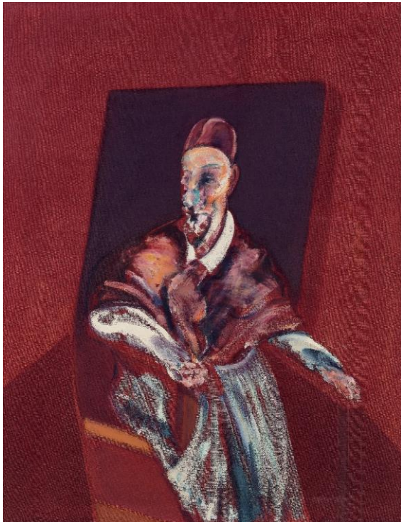
FRANCIS BACON (1909-1992) Seated Figure oil on canvas 60 1/8 x 47 in. (152.8 x 119.5 cm.) Painted in 1960