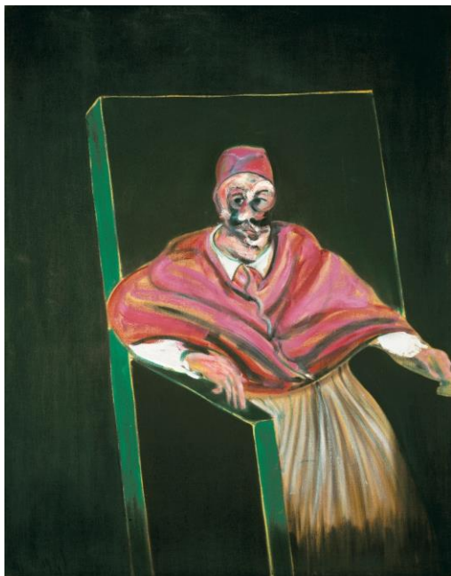
FRANCIS BACON (1909-1992) Study for a Pope I oil on canvas 59 \frac{7}{8} x 46 \frac{7}{8} in. (152 x 119 cm.) Painted in 1961