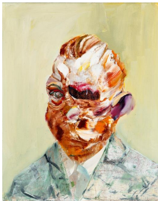
ADRIAN GHENIE (B.1977) Lidless Eye oil on canvas 19 \frac{3}{4} x 15 \frac{3}{4} in. (50.2 x 40 cm.) Painted in 2015