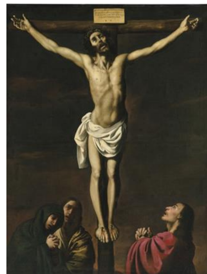
Francisco de Zurbarán, Christ on the Cross with the Virgin, Mary Magdalene, and Saint John at his feet (1655)

Sacred Noise is an exhibition exploring the themes of religion, faith and divinity, which will run from 25 June to 21 July 2018. Tracing the dialogue between Old Masters, including works by Titian and Francisco de Zurbarán and Post-War and Contemporary Art, the exhibition includes masterpieces from prominent UK & European Museums. The period when Western art was under church patronage is rich with significant names, while by the end of the 18 th Century, religion was dwindling as an influence, a situation that continued through the 20 th Century. From works by Pablo Picasso and Stanley Spencer, to Lucio Fontana's La Fine di Dio , to the irreverent Papal visions of Francis Bacon and Maurizio Cattelan, the exhibition will explore the legacy of European religious painting in modern and contemporary art.