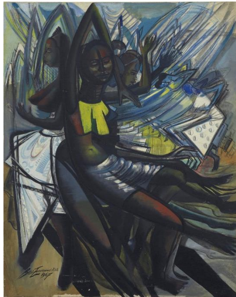
Ben Enwonwu Untitled (1967, estimate: 70,000-100,000)

Post-War to Present offers a compelling juxtaposition, contextualising the global contemporary talent of the future alongside established artists and the nourishment the past offers to the present. Estimates in Post-War to Present range from £5,000-500,000 providing opportunity for collectors at every level.