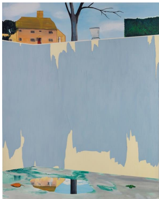
Dexter Dalwood, Brian Jones' Swimming Pool , (2000, estimate: £30,000-50,000)

Christie's will host Handpicked: 100 Works Selected by the Saatchi Gallery , a selection of 100 artworks from the collection held by the Saatchi Gallery that will be offered across both live and online auctions. The works chart the pivotal role the gallery has had in cultivating young artists and all proceeds will be used to support the Saatchi Gallery's notable free entry and education programme. Highlights are on view at the Saatchi Gallery until 18 June with the full exhibition taking place at Christie's King Street in June. Prices range from £600-30,000 collectors opportunities at every price point.