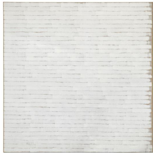
ROBERT RYMAN (B. 1930-2019) Untitled [Winsor] Winsor White oil on stretched sized linen canvas 76 x 76 in. (193 x 193 cm.) Executed in 1966. $6,000,000-8,000,000 20 th Century Evening Sale