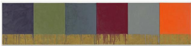
BRICE MARDEN (B. 1938) Free Painting 2 oil and graphite on canvas, in six parts each: 24 x 18 in. (61.5 x 46 cm.) overall: 24 x 108 in. (61 x 274.5 cm.) Painted in 2017. $4,000,000-6,000,000 20 th Century Evening Sale

PROCEEDS BENEFITTING THE THOMAS AND DORIS AMMANN FOUNDATION