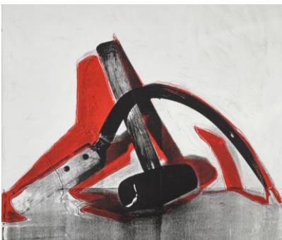
ANDY WARHOL (1928-1987) Hammer and Sickle acrylic and silkscreen ink on linen 72 x 86 in. (182.9 x 218.4 cm.) Painted in 1976 $4,000,000-6,000,000 20 th Century Evening Sale

Surface also played a pivotal role in the work of Brice Marden, as seen in his 2017 canvas, Free Painting 2 ($4,000,000-6,000,000) another highlight of the 20 th Century Evening Sale. Its minimalist appearance belies the tender, hand-made quality of the artist's paintings, and the subtle, time-consuming nature of their creation. In this work, we can see both, demonstrated in the highly finished blocks of color that dominate the upper portion of the canvas, and the delicate drips and painterly trails that occupy the lower section.