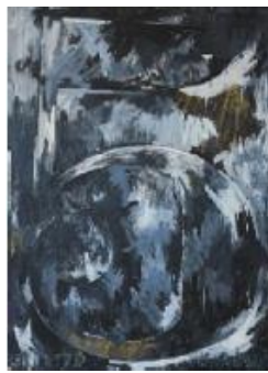
ELAINE STURTEVANT (1926-2014) Johns Big Figure Five (Study) encaustic and collage on canvas 48 x 36 in. (122 x 91.5 cm.) Painted in 1987 $300,000-500,000 Post War & Contemporary Day Sale