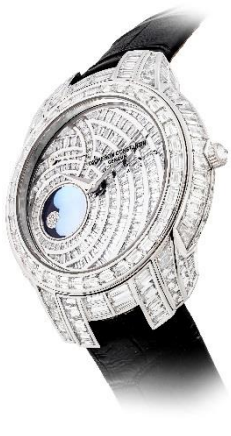
VACHERON CONSTANTIN. AN 18K WHITE GOLD DIAMOND-SET WRISTWATCH WITH POWER RESERVE, MOON PHASES AND MOTHER-OF-PEARL, KALLA LUNE MODEL, CIRCA 2008

HK$1,200,000-1,800,000/ US$150,000-225,000