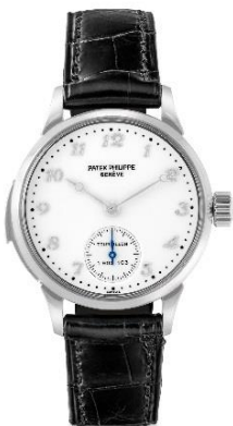
PATEK PHILIPPE. A PLATINUM MINUTE REPEATING TOURBILLON WRISTWATCH WITH ENAMEL DIAL AND BREGUET NUMERALS, REF. 3939, CIRCA 2003

HK$2,000,000-3,000,000/ US$250,000-380,000