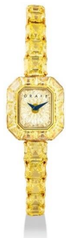
GRAFF. A LADY'S UNIQUE 18K GOLD AND FANCY INTENSIVE YELLOW DIAMOND-SET BRACELET WATCH WITH 22 GIA CERTIFICATES, YELLOW DIAMOND TRILOGY MODEL, CIRCA 2018

HK$1,600,000-2,500,000/ US$200,000-320,000