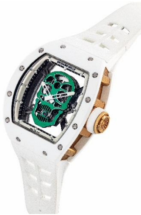
RICHARD MILLE. A WHITE CERAMIC AND 18K PINK GOLD LIMITED EDITION TONNEAU-SHAPED SKELETONISED TOURBILLON WRISTWATCH, ASIA LIMITED EDITION, TOURBILLON SKULL MODEL, NO. 01/06, REF. RM52-01, CIRCA 2015

HK$4,350,000-6,000,000/ US$550,000-750,000