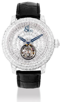
JACOB & CO. AN 18K WHITE GOLD AND BAGUETTE-CUT DIAMOND-SET LIMITED EDITION TOURBILLON WRISTWATCH, PALATIAL OPERA FLYING TOURBILLON MODEL, NO.06/18, CIRCA 2015

HK$1,200,000-1,800,000/ US$150,000-225,000