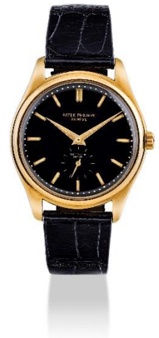
PATEK PHILIPPE. AN 18K GOLD AUTOMATIC WRISTWATCH WITH BLACK-COLOURED ENAMEL DIAL, RETAILED BY SERPICO, REF.2526, MANUFACTURED IN 1954

HK$1,200,000-2,000,000/ US$150,000-250,000