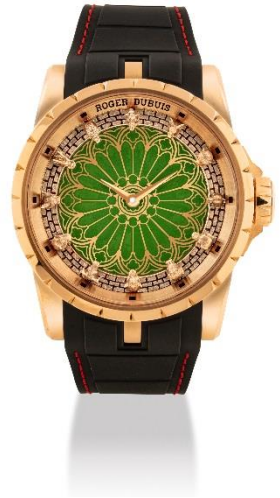
ROGER DUBUIS. A BRONZE LIMITED EDITION AUTOMATIC WRISTWATCH WITH ENGRAVED AND SCULPTED BRONZE MINIATURE CHINESE ZODIAC STATUES AND ENAMEL DIAL, EXCALIBUR TWELVE ANIMAL HEADS MODEL, NO. 5/12, MANUFACTURED IN 2019 HK$1,800,000-3,500,000/ US$225,000-450,000

HK$1,800,000-3,500,000/ US$225,000-450,000