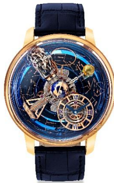
JACOB & CO. AN 18K PINK GOLD AND ORANGE SAPPHIRE-SET LIMITED EDITION GRAVITATIONAL TRIPLE AXIS TOURBILLON WRISTWATCH WITH SKY INDICATOR OF THE CELESTIAL PANORAMA, MONTH, DAY/NIGHT INDICATOR AND ORBITAL SECOND HAND, ASTRONOMIA SKY MODEL, NO. 15/18, CIRCA 2017

HK$4,350,000-6,000,000/ US$550,000-750,000