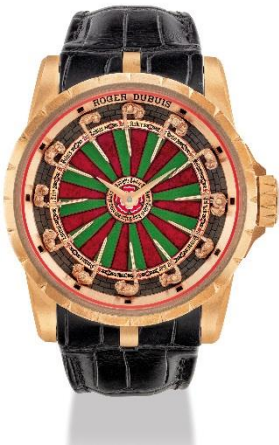
ROGER DUBUIS. A UNIQUE BRONZE AUTOMATIC WRISTWATCH WITH ENGRAVED AND SCULPTED 18K GOLD MINIATURE KNIGHTS AND ENAMEL DIAL, EXCALIBUR KNIGHTS OF THE ROUND TABLE MODEL, NO. 1/1, CIRCA 2018

HK$1,800,000-3,500,000/ US$225,000-450,000