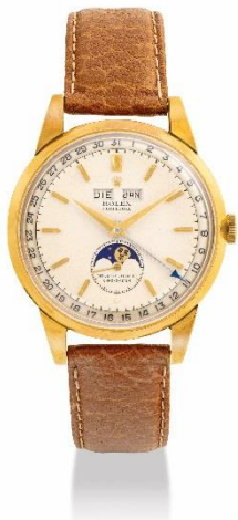
ROLEX. AN 18K GOLD AUTOMATIC TRIPLE CALENDAR WRISTWATCH WITH MOON PHASES, REF. 8171, CIRCA 1952

HK$1,400,000-2,000,000/ US$180,000-250,000