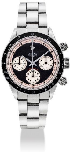
ROLEX. A STAINLESS STEEL CHRONOGRAPH WRISTWATCH WITH PAUL NEWMAN DIAL AND BRACELET, REF. 6263, OYSTER SOTTO MODEL, CIRCA 1969

HK$1,600,000-3,200,000/ US$200,000-400,000