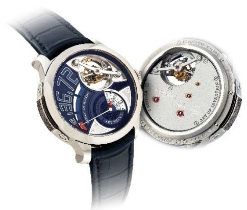
GREUBEL FORSEY. AN 18K WHITE GOLD DOUBLE TOURBILLON WRISTWATCH WITH POWER RESERVE, ART PIECE 2 EDITION 2 MODEL, CIRCA 2017

HK$1,900,000-3,500,000/ US$245,000-450,000