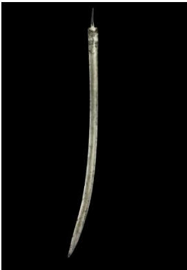
'Blood-Thirsty', a Personal Sword of the Emperor Aurangzeb (R.1658-1717) Mughal India, second half 17 th century Estimate: £30,000-50,000