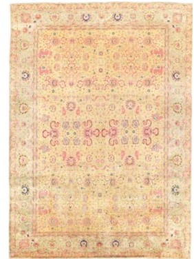
A Silk and Metal-Thread Koum Kapi Carpet Istanbul, Turkey, circa 1920 12ft.11in. x 9ft.5in. (393cm. x 285cm.) Estimate: £80,000-120,000

Please find links to the E-Catalogues here: