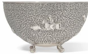
A Large Silver Repoussé Punch Bowl Kutch, India, second half 19 th century Estimate: £2,500-3,500