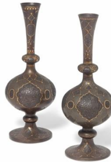
A Pair of Engraved Gold-Damascened Watered-Steel Vases Qajar Iran, 19 th century Estimate: £3,000-4,000