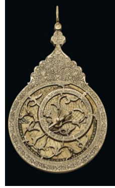
A Fine Safavid Brass Astrolabe Tabriz, Iran, dated AH 1117/1705-06 AD Estimate: £150,000-250,000