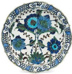
An Important 'Damascus-Style' Iznik pottery dish Attributable to the 'Master of the Hyacinths', Ottoman Turkey, circa 1555 Estimate: £70,000-100,000