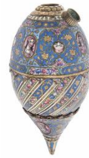
A Fine Enamelled Water Pipe (Qalyan) Qajar Iran, mid-19 th century 9in. (23cm.) high £3,000-4,000