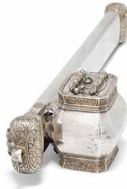
A Fine Ottoman Gemset Parcel-Gilt Silver Pen Case Period of Sultan Mahmud I (R.1730-1754AD) Estimate: £2,000-3,000