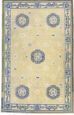
The Geloubewi Five-Medallion Carpet Ningxia, North China, late 17 th century 8ft.11in. x 5ft.7in. (271cm. x 171cm.) Estimate: £12,000-18,000