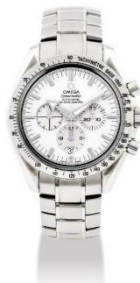
OMEGA SPEEDMASTER BROAD ARROW, REF. 178.0022 HK$70,000–100,000