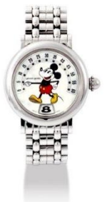
GERALD GENTA RETRO DISNEY MICKEY, STEEL WITH BRACELET HK$30,000–40,000

Sale Period: 23 May – 6 June 2017 | Sale Registration: 23 May 2017