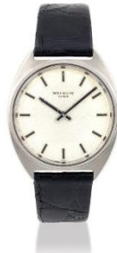
PATEK PHILIPPE REF. 3574 CALATRAVA CROSS DIAL HK$60,000–80,000