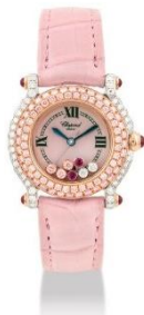
CHOPARD LADY'S HAPPY SPORT HK$70,000–100,000