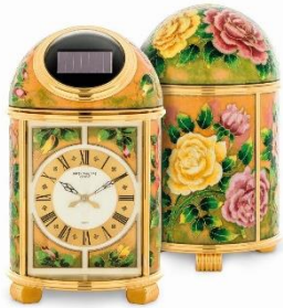
Left: PATEK PHILIPPE. A GILT BRASS DOME TABLE CLOCK WITH CLOISONNE ENAMEL BY VO. BARMONT, "JARDIN DES ROSES", REF. 1433M, MANUFACTURED IN 1996 HK$800,000–1,200,000/ US$110,000–160,000