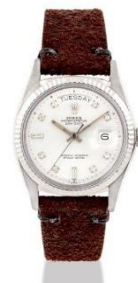
ROLEX DAY-DATE DIAMOND-SET DIAL, REF. 1803 HK$55,000–75,000