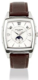
PATEK PHILIPPE GONDOLO CALENDARIO, REF. 5135G HK$130,000–180,000