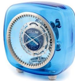
Right: JAEGER-LECOULTRE. A BLUE BACCARAT CRYSTAL LIMITED EDITION BUBBLE-SHAPED ATMOS ASTRONOMICAL CLOCK WITH MONTH AND EQUATION OF TIME, DESIGNED BY MARC NEWSON, ATMOS 566 MODEL, NO. 13/28, CIRCA 2010 HK$400,000–650,000/ US$52,000–84,000