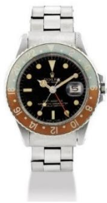
ROLEX GMT-MASTER GILT DIAL, REF. 1675 HK$90,000–150,000

Celebrating the arrival of Spring and Summer, the Hong Kong online-only sale is abloom with a fresh offering of 130 timepieces to rejuvenate the senses of both ladies and gentlemen. The wide-ranging selection covers pocket and wristwatches, complications and time-only timepieces in both sportive and classical styles together with bejeweled wristwatches, spanning the 19 th to 21 st centuries and across all price levels. While pocket watches, vintage Rolexes, Patek Philippe wristwatches and modern complications will appeal to the more cerebral collectors, others will be delighted by the visually dazzling diamond-set examples. Like spring flowers, the watches come in different shades of metal ranging from white to pink and in a myriad of shapes including that of a bursting sunray heralding the nascent spring light and colours.