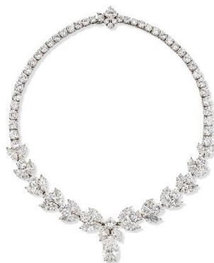
Garrard diamond necklace Pear-shaped diamond of 4.78 carats Estimate: £170,000 - 220,000