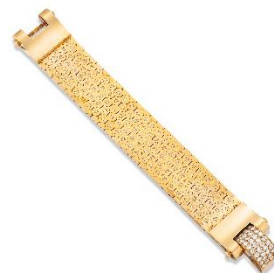
Van Cleef & Arpels diamond 'Ludo Hexagone' bracelet circa 1940 Estimate: £30,000 - 40,000