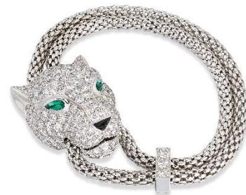
Cartier diamond, emerald and onyx 'Panthère' bracelet Estimate: £30,000 - 50,000