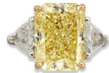
Ritz coloured diamond ring Fancy intense yellow diamond of 12.56 carats Estimate: £120,000 - 150,000

A beautiful offering of signed jewels feature a Van Cleef & Arpels diamond 'Ludo Hexagone' bracelet (estimate: £30,000 - 40,000), circa 1940, alongside a diamond necklace by Garrard showcasing a pear-shaped diamond of 4.78 carats (estimate: £170,000 - 220,000). A fancy intense yellow diamond ring of 12.56 carats by Ritz (estimate: £120,000 - 150,000) will also be presented.