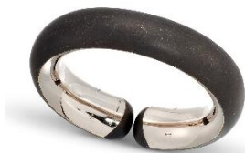
Hemmerle iron 'Harmony' bangle Estimate: £8,000 - 12,000