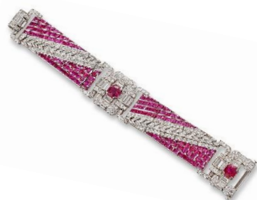
Art Deco ruby and diamond bracelet circa 1930 Estimate: £40,000 - 60,000