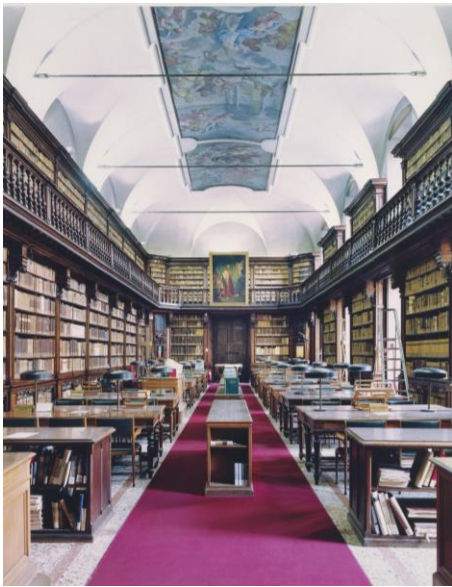
Candida Höfer, Bibliotheca di Brera Milano IV (2005, estimate £20,000–30,000)