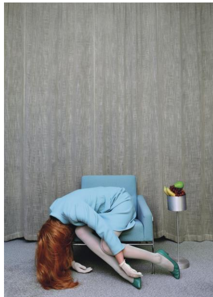
Anja Niemi, The Secretary (2013, estimate £5,000–7,000)