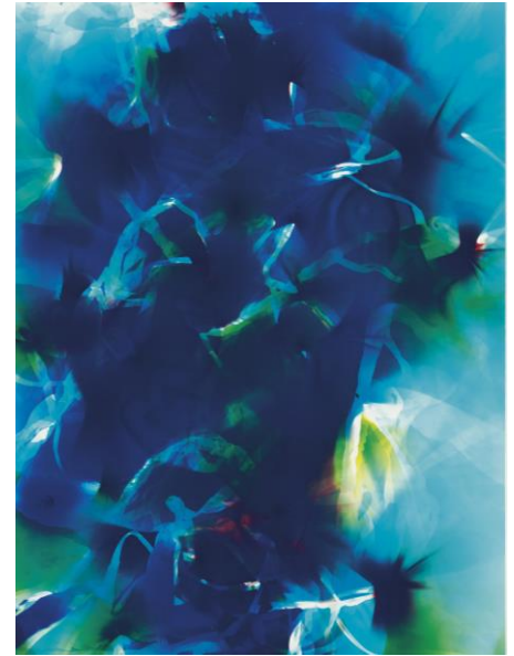
Wolfgang Tillmans, Small Mental Picture II (2000, estimate £30,000–50,000)

London – Christie's Photographs auction on 17 May 2018 will showcase work by contemporary artists, fashion photographers and icons of the 20 th Century. The sale will be led by Robert Mapplethorpe's portrait Ken Moody and Robert Sherman (1984, estimate: £70,000-90,000), in which two male heads are juxtaposed in profile, infused with the near sculptural elegance and classical composure that defined Mapplethorpe's still-life photographs and portraits during this period. Other prints of the image are in the collection of The Solomon R. Guggenheim Museum, New York and The J. Paul Getty Museum, Los Angeles. Further highlights include large-format portraits by Hiroshi Sugimoto and Desirée Dolron and Nick Brandt's iconic image Elephant Drinking (2007, estimate: £50,000-70,000).