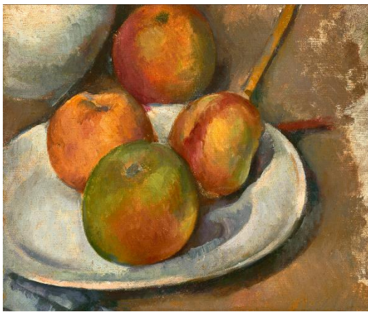
PAUL CEZANNE (1839–1906) Quatre pommes et un couteau Painted in 1885 Estimate : $ 7 million – 10 million