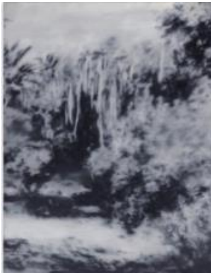
Gerhard Richter (b. 1932) Waldstück (Chile) oil on canvas 68½ x 48⅞in. (174 x 124cm.) Painted in 1969 Estimate: £3,000,000-5,000,000 Sold for: £4,450,500 / $7,094,097 / €5,540,873

Record prices set for 13 artists including Alighiero Boetti, Rachel Whiteread and Joe Bradley