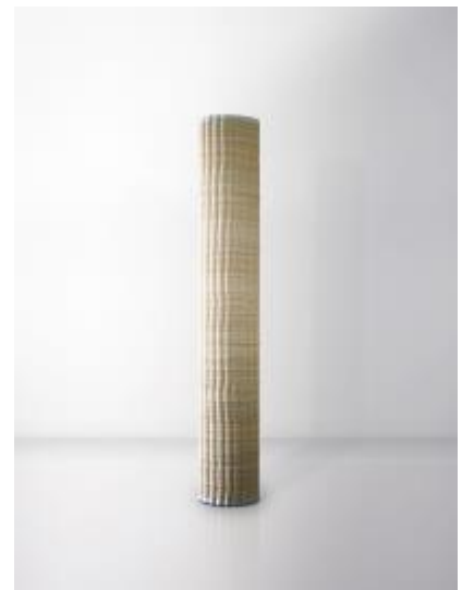
Alighiero Boetti (1940-1994) Colonna (Column) paper doilies and iron 83 1/8 x 14 1/4 x 9 3/8in. (211 x 36 x 24cm.) Executed in 1968 Sold for: £2,434,500 / $3,880,593 / €3,030,953

London – Christie's October week of Post-War and Contemporary Art auctions in London resulted in a record breaking combined total of £129,196,575 /$206,750,233/ €162,057,210, doubling last year's previous record of £67,854,250, and making it the highest Post-War and Contemporary Art October auction week ever. The successes of the Essl Collection, the Evening and Day Auctions and The Italian Sale demonstrated an appetite for the highest quality work from bidders around the world, and created 13 artist records across the week's auctions.