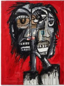
ISSHAQ ISMAIL (b. 1989) Unknown Faces 8 Sold for $275,000