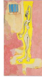
GEORGE CONDO (b. 1957) Pink Nude in Prison Sold for $212,500