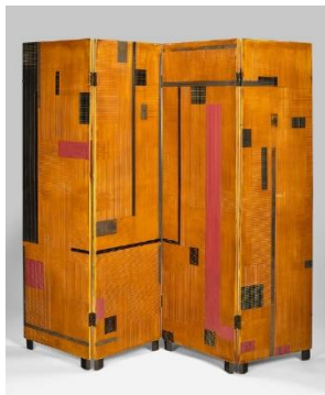
JEAN DUNAND (1877-1942) FOUR-PANEL SCREEN, CIRCA 1927 lacquered wood each panel : 68¾ x 19½ in. (174,5 x 49,5 cm) signed Jean Dunand $180,000-240,000