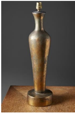
ALBERTO GIACOMETTI (1901-1966) 'GRECQUE' TABLE LAMP, GRAND MODÈLE, CIRCA 1937 plaster, galvanized brass 18½ in. (47 cm) high, 5½ in. (14 cm) diameter (excluding shade) $200,000-300,000