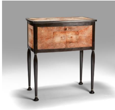
ANDRÉ GROULT (1884-1966) WRITING DESK, CIRCA 1913 Ceylon ebony, shagreen, resin 36¼ x 32¼ x 17½ in. (92 x 82 x 45,5 cm) closed $150,000-200,000