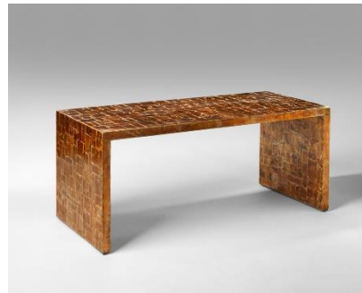
JEAN-MICHEL FRANK (1895-1941) LOW TABLE, CIRCA 1928 executed by Chanaux & Pelletier, Paris mica, beech 16 x 37. ½ x 17 in. (40,4 x 95,5 x 43,3 cm) impressed CP J.M.FRANK 7811 and MADE IN FRANCE $250,000-350,000