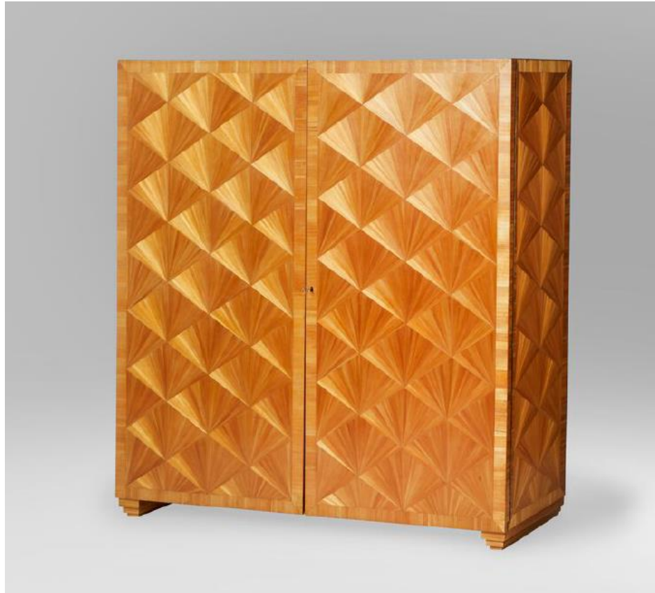
JEAN-MICHEL FRANK (1895-1941) IMPORTANT CABINET, CIRCA 1925 executed by Chanaux & Pelletier, Paris straw marquetry, iridescent yellow peroba, avodire 58 \frac{7}{8} x 55 \frac{1}{2} x 15 \frac{1}{2} in. (149.5 x 140 x 39 cm) impressed CP, numbered 2217 $500,000-700,000

New York - Christie's is pleased to announce The Spirit of Paris: An Important Private Collection of 1920s & 1930s Design , a live Design auction taking place at Rockefeller Center on 6 June 2022. Assembled with great discernment, the collection features rare furniture and objets d'art that illustrate the creative and cultural vivacity of Paris in the Twenties and Thirties.