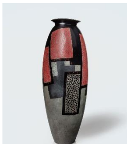
JEAN DUNAND (1877-1942) VASE, circa 1925 partially lacquered lead 15 in. (38,1 cm) high, 5. ¼ in. (13,5 cm) diameter impressed JEAN DUNAND 4918 $70,000-90,000