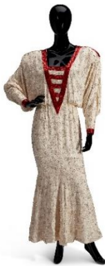
A RED AND WHITE BEADED PONGEE SILK EVENING DRESS

CIRCA 1985 Worn during the 50th Presidential Inauguration Ball for Ronald Reagan in Washington DC, 19 January 1985