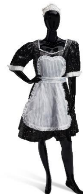
A BLACK GLITTERED POLYESTER MAID DRESS WITH WHITE TULLE ATTACHED APRON AND WHITE TULLE AND LACE HAT

Likely worn for a live performance of 'She Works Hard for the Money' released in 1983