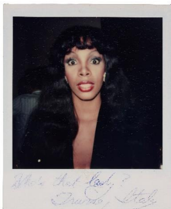
DONNA SUMMER (1948-2012)

Photograph with autograph inscription ("Who's That Lady?"), Italy, [ca May 1977]