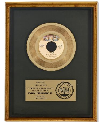
RIAA GOLD RECORD AWARD ISSUED TO DONNA SUMMER FOR 'LAST DANCE'

A Recording Industry Association of America gold record award for the 1978 single 'Last Dance' for sales of more than 1,000,000 copies for Casablanca Records, framed