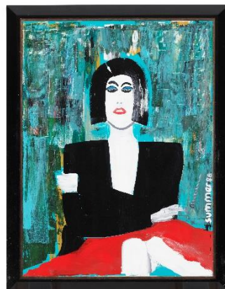
DONNA SUMMER (1948-2012)

Chairman of the Board signed and dated 'summer 88' (right side) acrylic on canvas Executed in 1988.