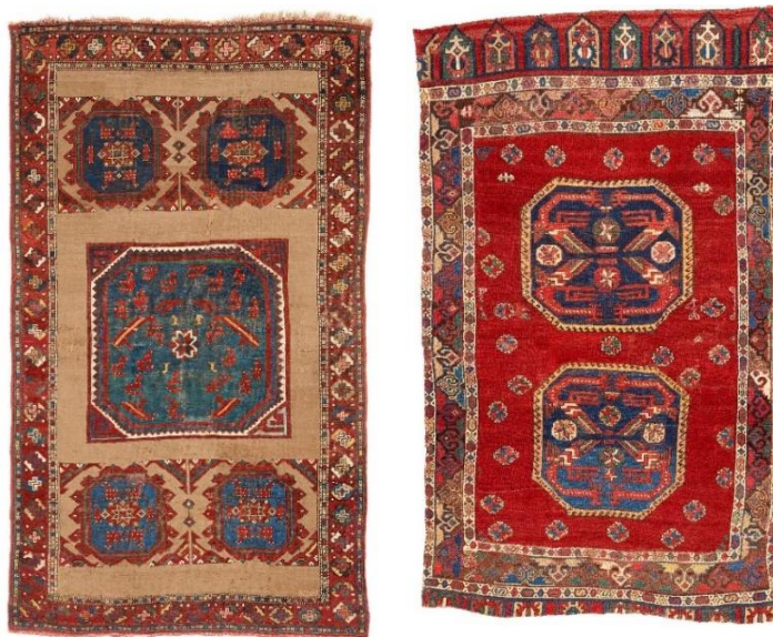
Holbein 'Variant' rug,

Showing the strength of the classical Anatolian carpet market, the highlight of the sale ( illustrated far right ), (lot 195) was an extremely rare Anatolian 'Phoenix In Octagon' rug woven in the late 15 th /early 16 th century, Central or Eastern Anatolia (estimate £100,000-150,000) which realised £214,200. One of only 18 examples remaining from the early Ottoman, 'Animal Carpet' group, this piece is unique as the only known carpet to survive bearing the mythical figure of the phoenix. Of the dozen examples offered, that ranged from the late 15 th to the late 17 th centuries, over 90% sold, many going to European collectors. The second highest price achieved was for a ( illustrated right ) late 16 th /early 17 th century (lot 197) (estimate £80,000-120,000) which realised £88,200.